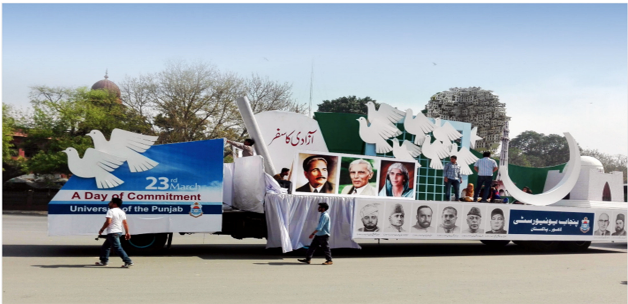
Figure 3. Retrieved from PU Factbook 2018, reflecting a celebration of Pakistan Day with pictures of the national figures Muhammad Ali Jinnah, Allama Iqbal, Fatima Jinnah, and many others, with the words azadi ka safar (road to freedom) written above the pictures (Source: PU.edu.pk ( http://pu.edu.pk/downloads/Fact-Book-2018.pdf , accessed on 10 September 2021)).

students in PU were asked to paint the national flag to commemorate the Independence Day of Pakistan and for Pakistan Day (a national holiday commemorating the resolution of Pakistan on 23 March 1940) parade in 2018, an event with the eulogisation of national heroes (as seen in Figure 3 below). This nationalistic discourse that focused heavily on instilling patriotism in students and fostering pride in the national figures of the past was complemented by the visual aid provided by the presence of the flag and the symbolic value attached to it.