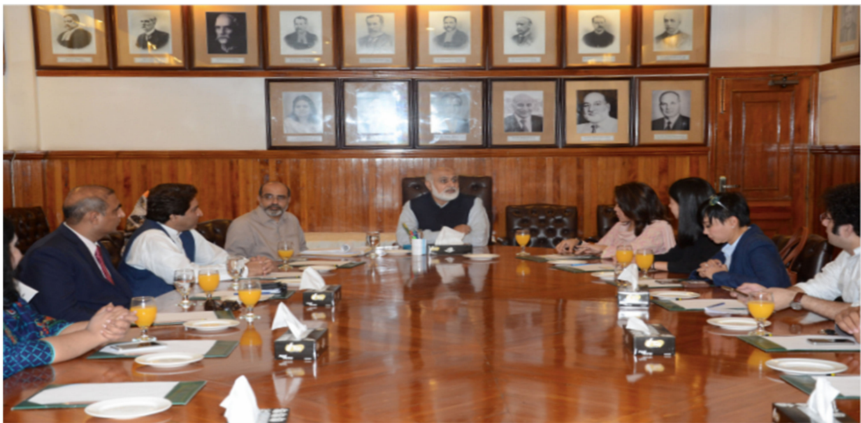
Figure 4. Here, in the board room, pictures of national figures of Pakistan (mostly men), such as Muhammad Ali Jinnah and Allama Muhammad Iqbal, can be seen plastered over the walls. Retrieved from Punjab University (Pakistan) (Source: PU.edu.pk ( http://pu.edu.pk/downloads/Fact-Book-2018.pdf , accessed on 10 September 2021)).

The walls of heroes are not just exclusive to Delhi; even in Lahore, public universities are filled with portraits and pictures of national figures deemed important to the freedom struggle of the country. In both Punjab University (PU) and Government College University (GCU), the entrance of the universities and a number of their buildings (particularly the senate house in PU) houses portraits of national icons such as Muhammad Ali Jinnah, Sir Syed Ahmed Khan (Islamic reformer, educationist known for his contributions to the welfare of Muslims in the subcontinent during British rule) and Allama Muhammad Iqbal (See for instance Figure 4).