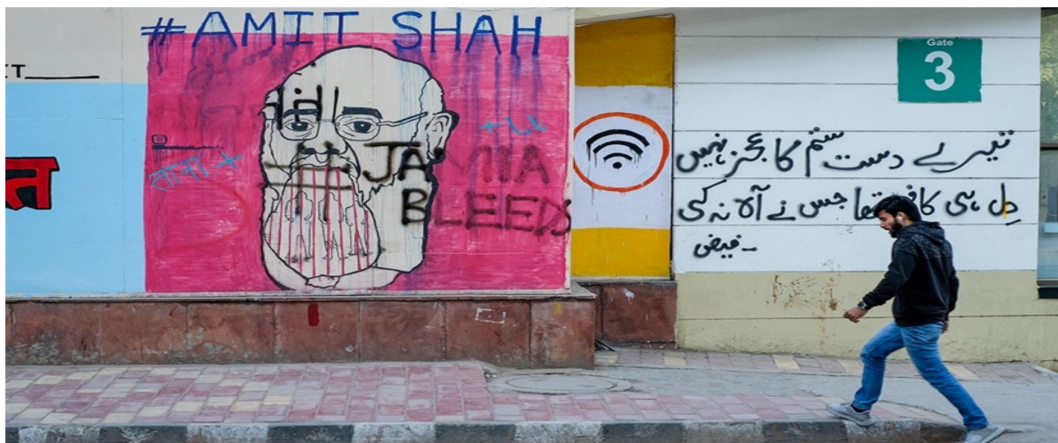
Figure 7. (Translated as ‘there is no return for the pain you have given, my heart is at fault for not protesting’—Faiz.) A graffiti inside the JMI campus denouncing police brutality reads: ‘There is no return for the pain you have given, my heart is at fault for not protesting’—Faiz (Source: [60]).

Students generally take their ideas from the posters that are put up by various artists on the open forum for everyone to use and mix them with couplets of revolutionary poets like Faiz Ahmed Faiz (one of the most celebrated poets of Pakistan, an avowed Marxist who won the Lenin Peace Prize for his contributions, also known for his writings against oppression in all its forms) [63]. A student said that ‘Banksy is the inspiration for everyone who is associated with graffiti and street art but our creations draw inspiration from the poems as well. We are trying to come up with a Bengali typography. We already have Urdu and Hindi—it is easier for a passerby to read’ [63]. Most of the students were painting graffiti for the first time but adopted this as the primary form of their protest [63].