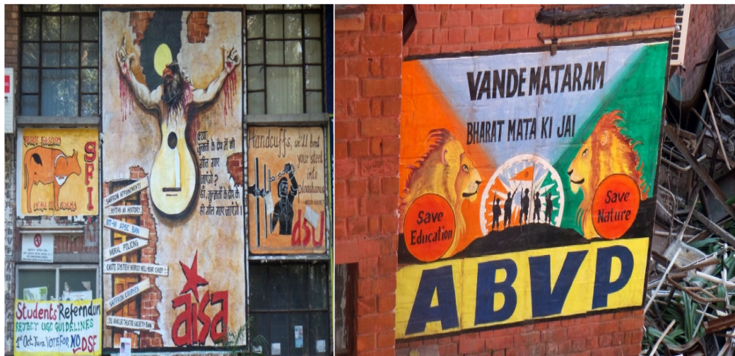
Figure 5. Graffiti inside the JNU campus shows All India Students' Association (AISA) and Students' Federation of India's (Left student group) versus Akhil Bharatiya Vidyarthi Parishad's (ABVP) (RSS-affiliated organisation). The second picture, by ABVP, reads: 'I praised to motherland, Mother. Victory for Mother India'.