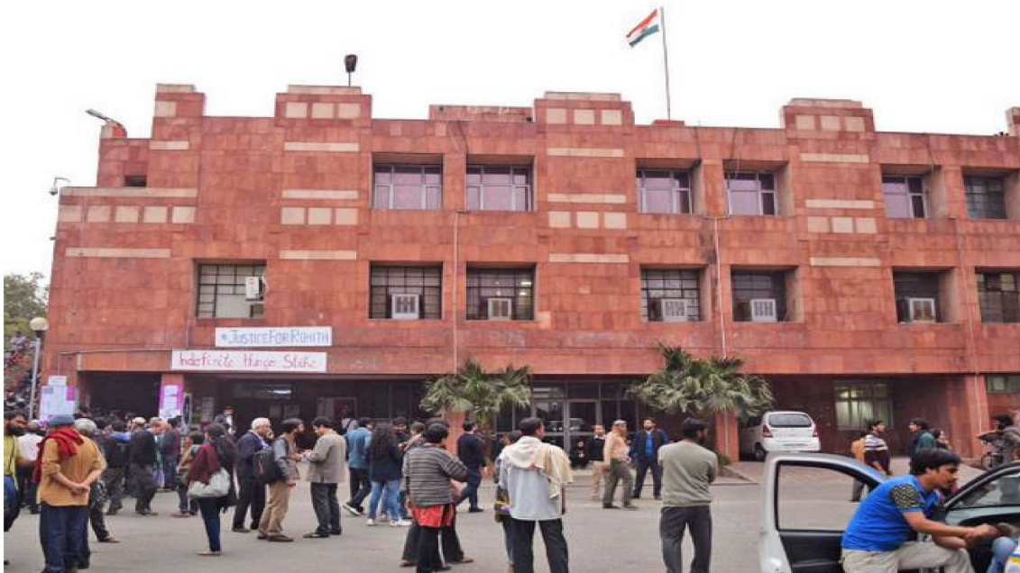
Figure 2. The national flag waving atop the Jawaharlal Nehru University (JNU) (Source: The Hindu ( https://www.thehindu.com/news/cities/Delhi/15-years-before-hrd-diktat-jnu-hoisted-flag/article8259680.ece , accessed on 10 September 2021)).

anti-India slogans were raised. Hence, the conceived impact of the existence of the flag (as a symbolic gesture and by the government itself) would be to influence feelings of nationalism in students. The chairman of the Centre for Media Studies at JNU said that the government's decision was aimed at 'instilling nationalism and pride' in students and was one of 12 resolutions passed by the vice-chancellors [49].