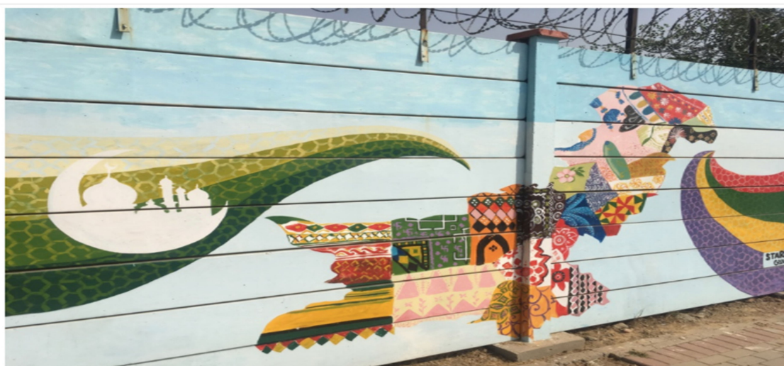
Figure 9. Wall outside Punjab University (Pakistan) showing a colourful and vibrant version of Pakistan’s map and a drawing showing the crescent from Pakistan’s flag, with a mosque drawn against a green background, denoting the flag’s colour.

Interestingly, graffiti and wall art have also been employed on the walls of PU and GCU as a way of fostering national belonging towards the state, particularly in the last few years. In PU, the graffiti in the form of street art which covers the outer walls of the entire campus was commissioned by the government itself ‘through an activity of Street Art on the thematic areas of Interfaith Harmony, safer charity practices, COVID-19, Resilience building, and the role of families and women in the promotion of peace’ [64]. The artists were not just students from PU but also from schools, colleges, and universities across the country [64]. While addressing the media and applauding this initiative, the Deputy Commissioner of Lahore specifically mentioned how it was incredibly significant for the promotion of the national narrative—explicitly highlighting the role of the walls in fostering messages of national pride. Some photographic evidence of the graffiti is given below, in Figures 9 and 10.