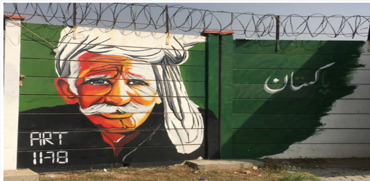
Figure 10. Wall outside Punjab University (Pakistan) showing Pakistan written in Urdu, with green paint denoting the colour of Pakistan’s flag and the painted picture of a man wearing a turban (Source: urbanduniya.com , accessed on 10 September 2021).

In Figure 9, the ‘green’ of the Pakistani flag is coalesced with beautiful colours and a tapestry, resulting in striking street art that represents the symbolic elements of the country—its map, flag, and the crescent moon encasing a mosque. The mosque next to the map is particularly symbolic and reflective of the commingling of the Pakistani nation with Islam.