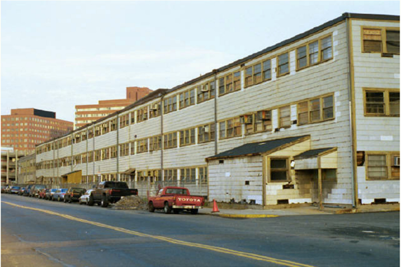
Figure 1. Building 20 at MIT. MIT gives its inhabitants freedom to repurpose, redesign, and use the building in ways to foster creativity and independence of thought (Source: DGC Oregon.com ( https://djcoregon.com/news/2012/06/19/building-20-what-made-it-so-special-and-why-it-will-probably-never-exist-again/ last-accessed 10 September 2021)).

What is missing from the literature is the understanding of how this serves as a form of visual culture (through the built environment, photographic culture, and so on) and how it can be implicitly and explicitly used as a form of furthering a country's national narrative.