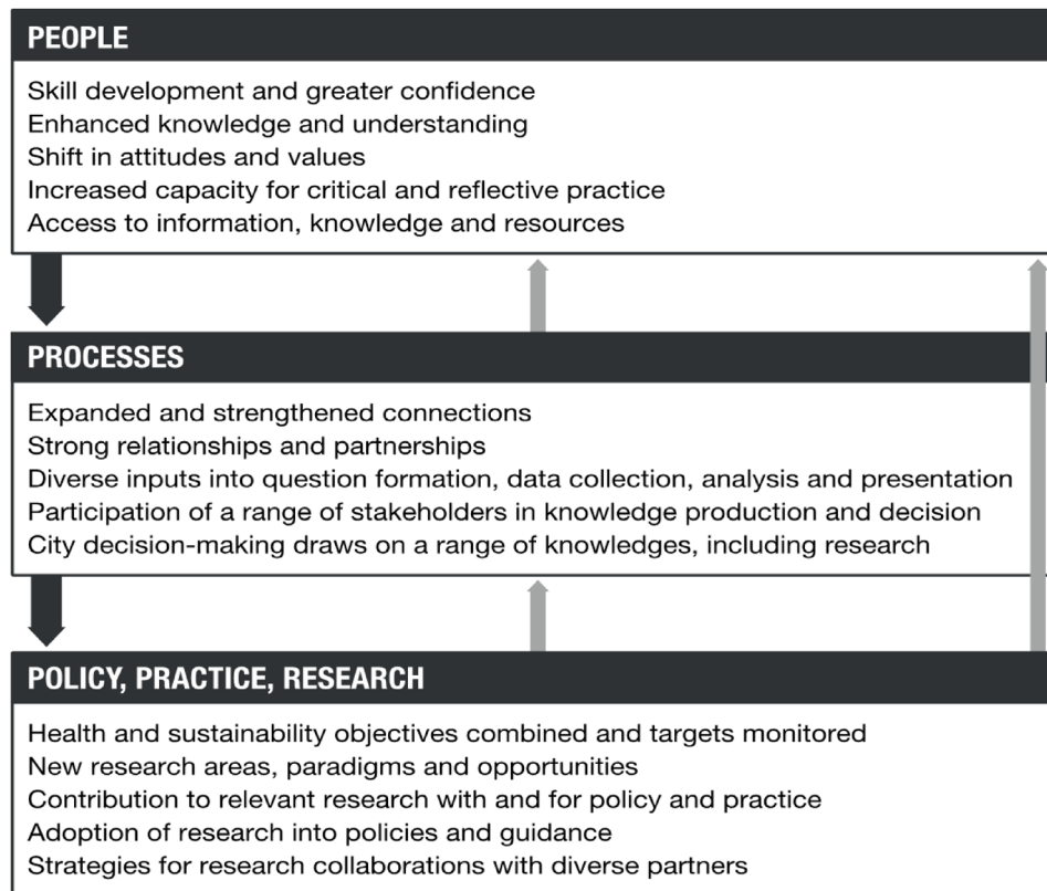
Figure 2. Change model for Complex Urban Systems for Sustainability and Health (‘CUSSH’). Dark arrows are feed-forward. Light arrows are feedback.