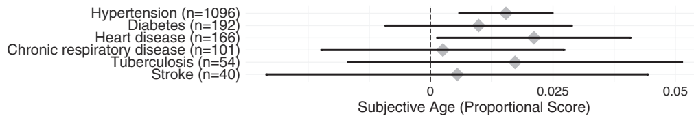
Figure 3. Estimates of the associations (with 95% CIs) between a range of specific diseases and Subjective Age as proportional score ( N = 3,028). Estimates are controlled for demographics (age, sex, household size, education). For each estimate associated with a condition, the reference is participants without that condition. The number of cases for each disease in the data set is denoted by n . Only diseases with n \geq 30 cases were included. Information on Hypertension and Diabetes was based on either objective physical examinations or self-report. Information on other diseases was based on self-report to a question of the format: Has your health care worker ever informed you that you have, e.g., heart disease?

negative association between the WHOQOL’s subjective health item and SA is also depicted in Supplementary Figure 3 .