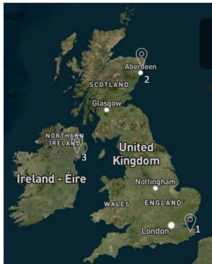
Figure 1. Map of case study locations: Domaine Evremond (1), Trump International Golf Links (2), and AgriAD (3) (Author’s own, sourced from Open Street Map, 2021).