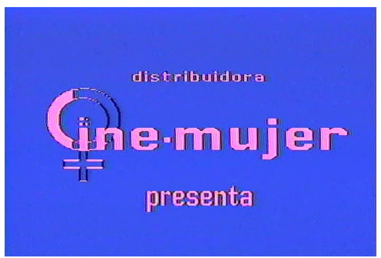
Figure 1: The logo of Cine Mujer. Screenshot.