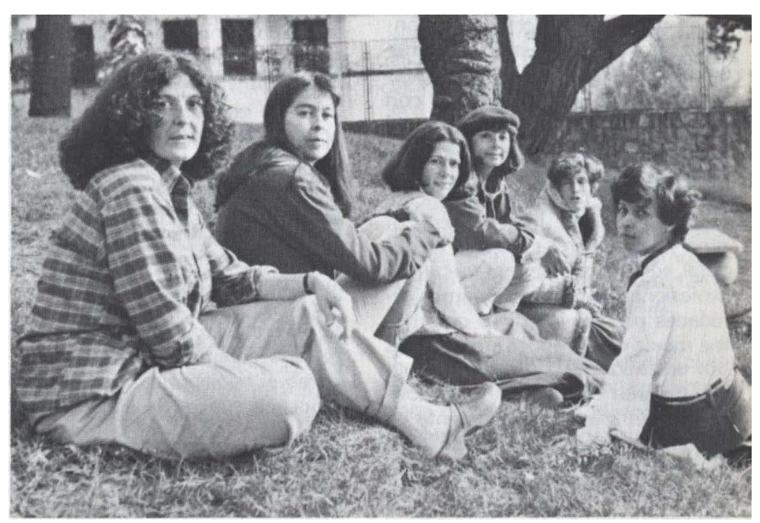
Figure 2: The women behind Cine Mujer.