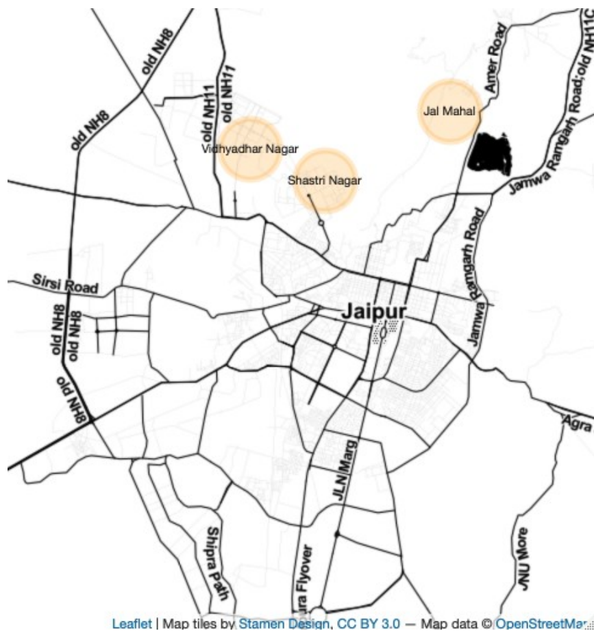
(Figure 1. Geography of the study localities)