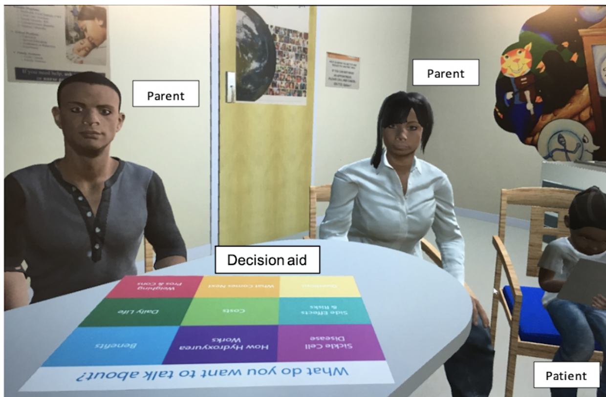
Figure 3. The clinical environment viewed through the virtual reality headset.