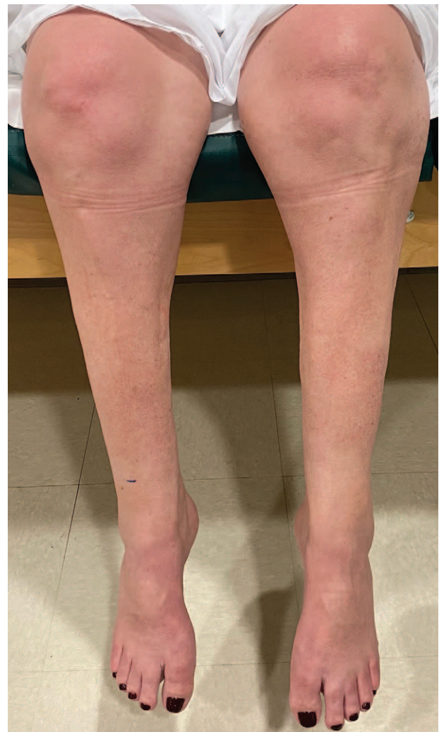
Figure 2. Bilateral flail foot and severe atrophy of anterior and posterior leg compartments.