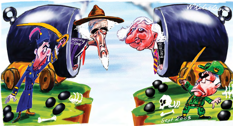
Figure 8. Paul Keating and John Howard squaring off.

Two visions of Australia were in conflict during the 1990s. Both had their prime minister, and each was identified with an historian—Manning Clark and Geoffrey Blainey, respectively.