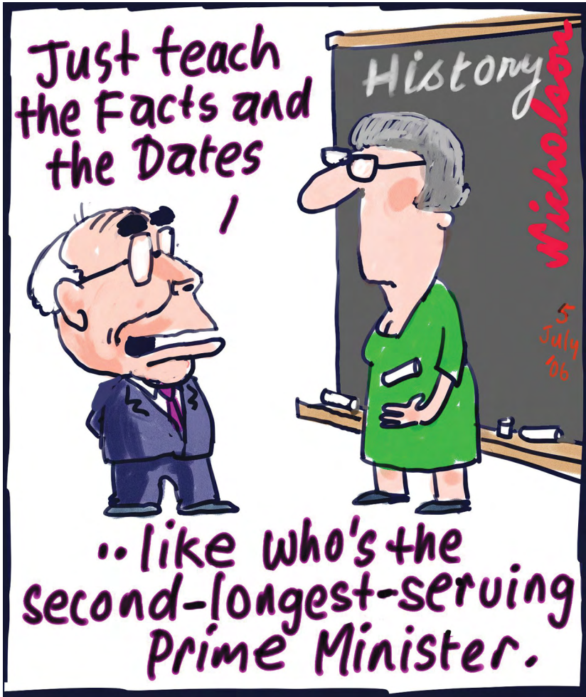
Figure 9. John Howard on history, facts and dates, 5 July 2006.

Source. © Peter Nicholson (Rubbery Figures Pty Ltd) 2006 ( nicholsoncartoons.com.au/ ). Reproduced with permission.