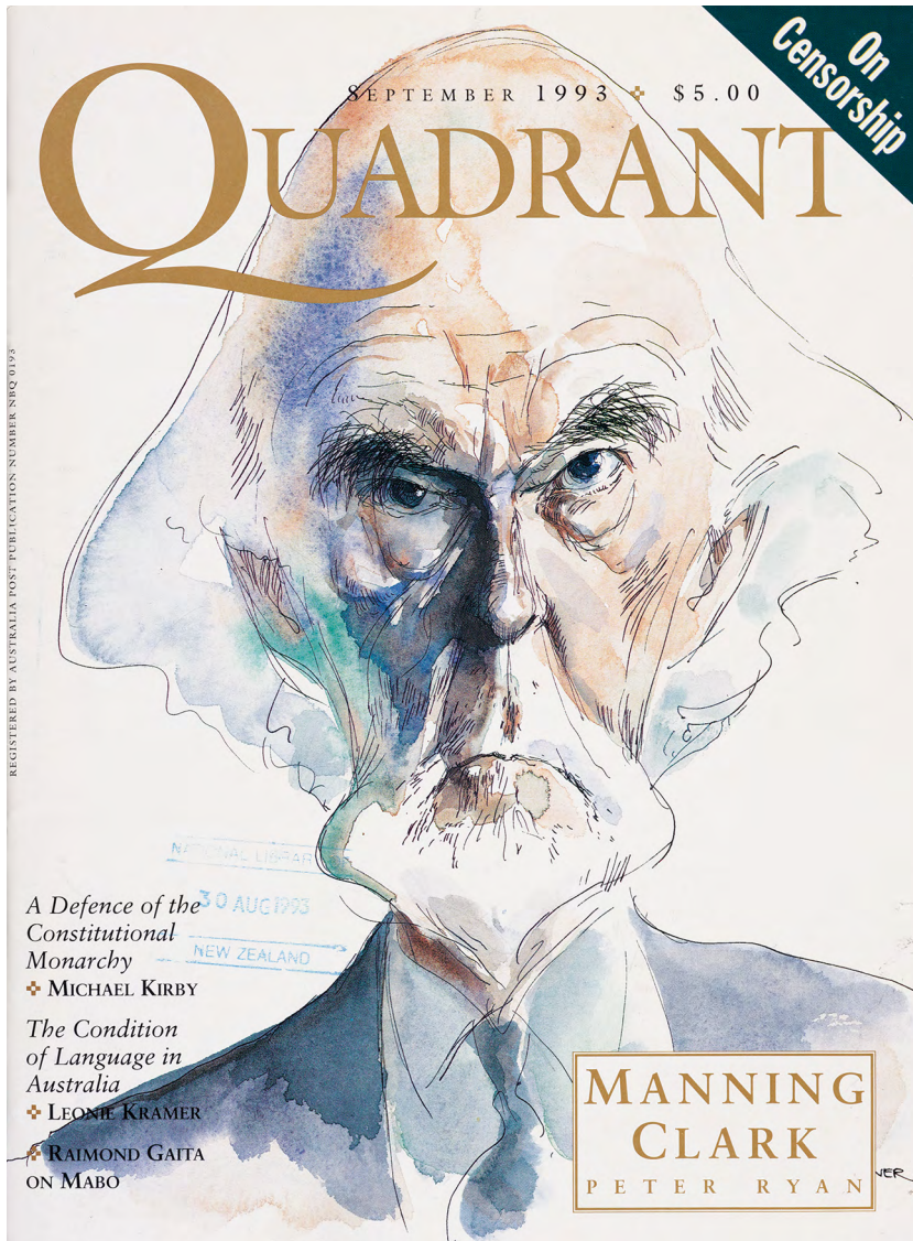
Figure 1. Caricature of Manning Clark on the front cover of Quadrant , September 1993.