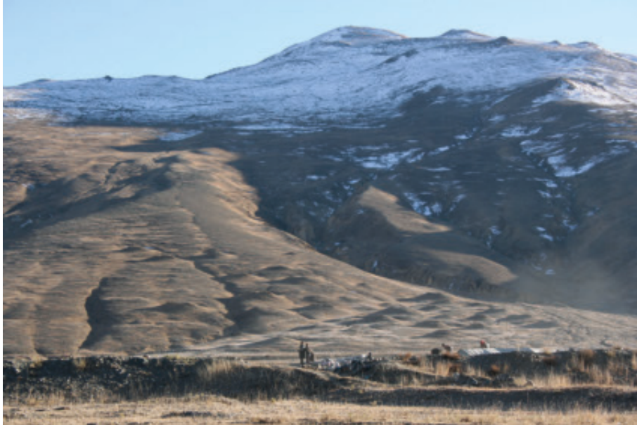
Fig. 1. The landscape of a tumulus field in Central Tibet: the site of 0281 in the Ser po valley of Myang stod (Rgyal rtse County). Photo: G. Hazod 2008