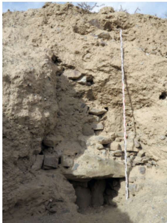
Fig. 8. The situation of destroyed mounds provides access for examination and sometimes serves as an essential requirement for reconstructing the graves' inner architecture: an opened tomb of 0131 (Thang dga' District, Stag rtse County).