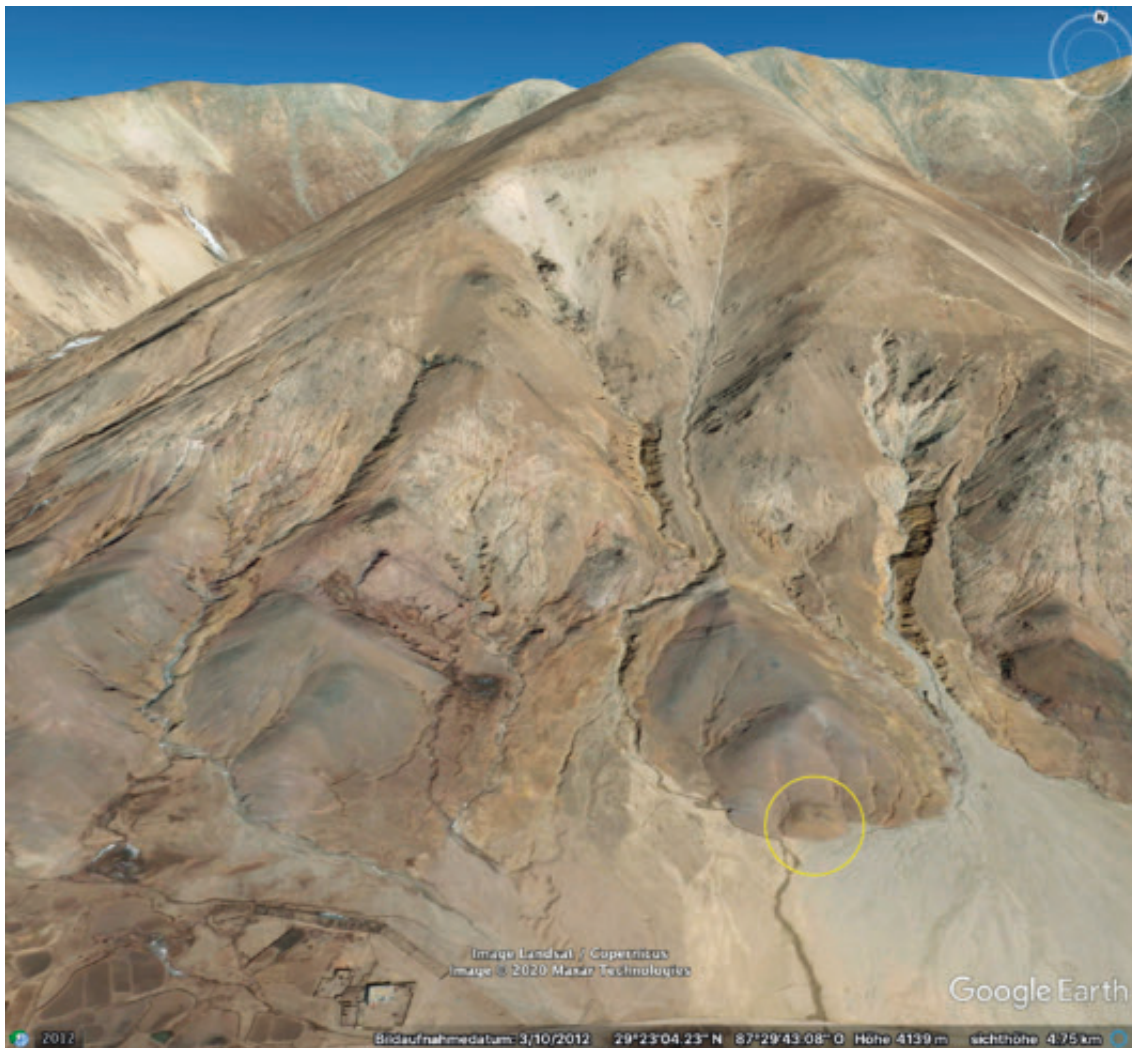
Fig. 5. The single mound: the elite tomb of 0325, Chu 'og District, Ngam ring County. Map data: Google, Maxar Technologies 2011; modifications and additional data: G. Hazod