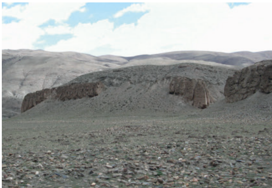
Fig. 4. The massive “coffer-shaped” type of tumulus: the elite tombs of 0076 situated in central G.ye yul, Chu gsum County.