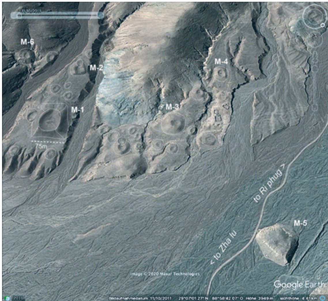
Fig. 6. Plundered tombs. Almost all tumuli are historically opened mounds – usually indicated by the indentation at the top of the mounds: the tumulus site of 0581, situated next to the famous Zha lu monastery in Lower Myang (Rgya mtsho gzhung District, Gzhis kha rtse County).