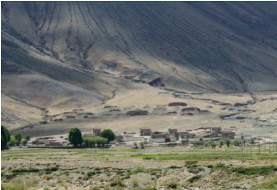
Fig. 2. The classical burial mound field is situated not far from the settlement and arable zone – the grave field of Spang skyid (0172) in Upper Stod lung, Stod lung County (field type: FT-A).