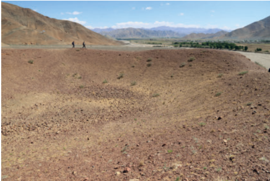
Fig. 7. The enormous crater on top of the central mound of 0581 (M-1 of Fig. 6); in the background Zha lu, village and monastery.