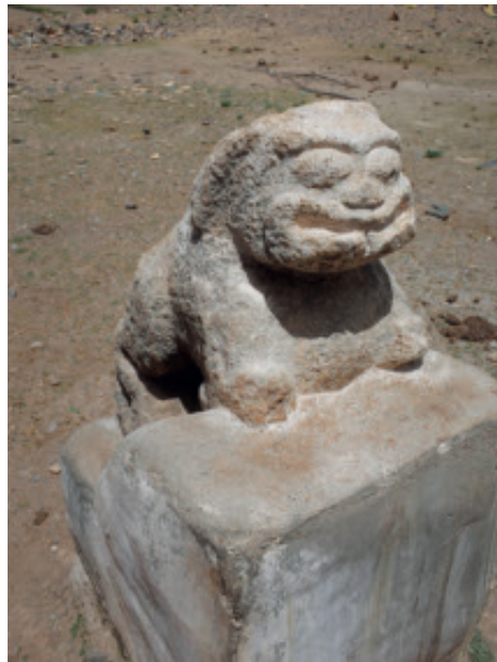
Fig. 10. Grave decoration: a tomb lion from the burial ground of 0242, Grub brya District, Lhun grub County.