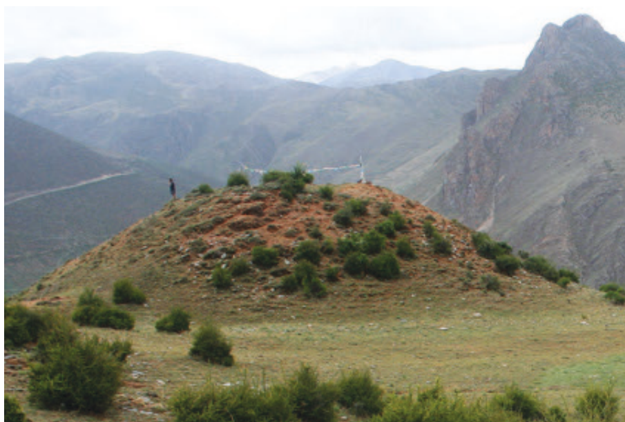
Fig. 3. The central mound of 0105 in eastern Mal gro, Mal gro Gung dkar County – a tumulus field higher up in the mountain region (FT-B type).