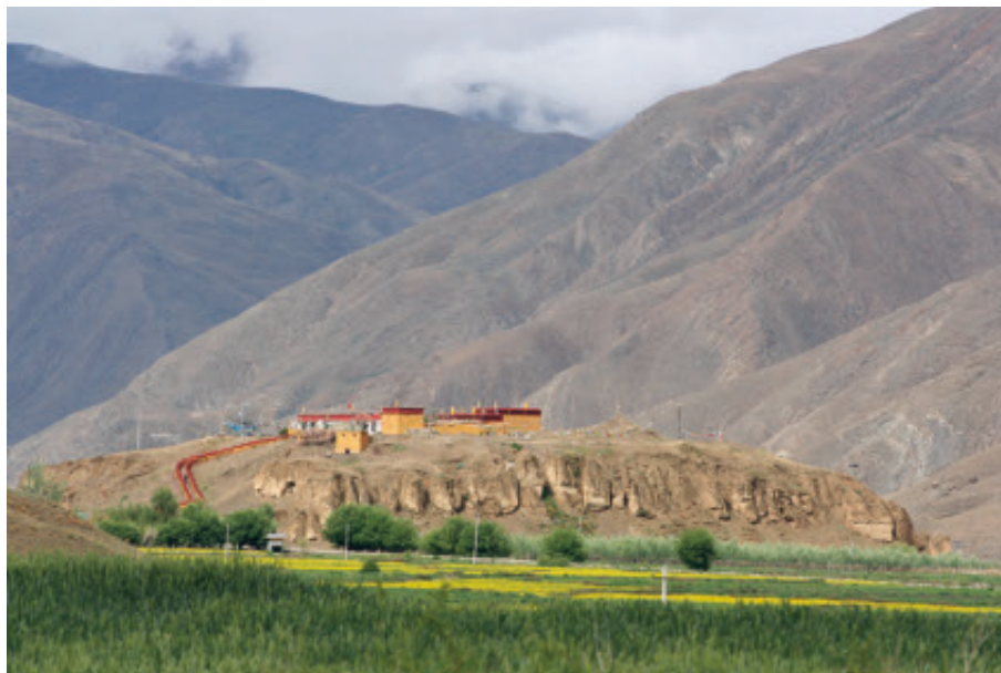
Fig. 11. The tomb of Emperor Songtsen Gampo (d. 649 CE) situated in the royal grave field of Mu ra (0032), 'Phyong rgyas Distirict. The temple on top of the mound is from the early 13th century.