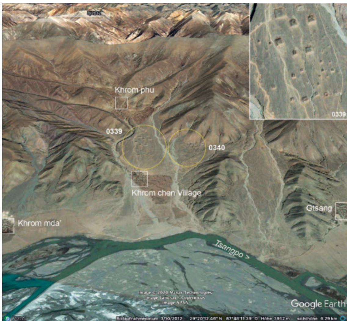
Fig. 9. The landscape of the tumulus fields of Khrom chen (western Gtsang, Lha rtse County). The site with altogether ca. 135 burial mounds of various categories is assumed to have been used as “family cemetery” – associated with the aristocratic family of ’Bro. Map data: Google, Maxar Technologies 2012; modifications and additional data: G. Hazod