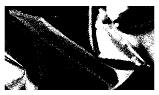
WEEKLY ROUNDUP: OCTOBER 8, 2021