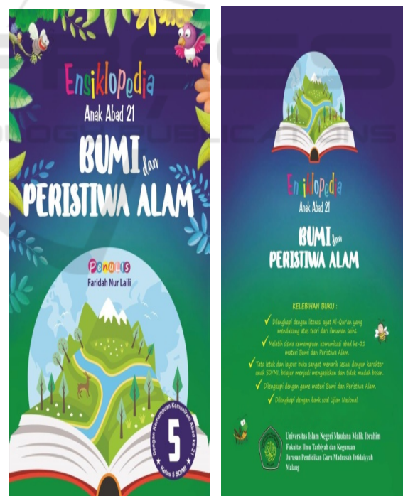
Figure 1: The cover of the developed teaching materials

The five indicators are integrated in each chapter. In detail, this encyclopedia-based teaching material has been completed with an encyclopedia usage guide, book content, competency standards and basic competencies. The material content covers the scope of the earth and the universe in the subject matter of the earth and natural events, Qur'anic literacy, and concept maps interesting facts. It is also completed with 21st century communication skills competency tests, reflections, national exam questions, and glossaries. Figure 1 and 2 are the cover and the specification of the contents of the developed teaching materials.