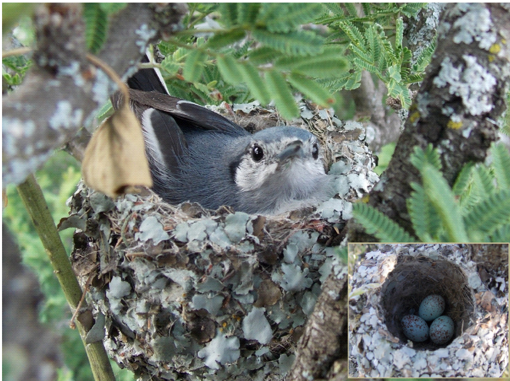
Figure 1. Nest and eggs of Masked Gnatcatcher found in the locality of Río Ceballos, Córdoba Province, Argentina.

To compare the average daily incubation and patterns of incubation behavior among the periods of the day (morning, midday and afternoon), we used