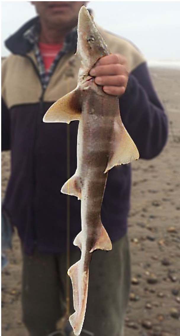
Figure 2. Specimen of Mustelus fasciatus from “El corvino”, it was captured using rand released alive by a local angler.

this absence in scientific surveys made during the 1990s (Massa 2012). This downward trend in the population in the AUCFZ has also been observed in Uruguay; during scientific surveys there, only 2 individuals were captured in fall of 2001 (1 female, TL = 157 cm, weight = 25.2 kg, depth = 20 m; 1 unsexed individual, TL not recorded, weight = 17.4 kg, depth = 22 m) (L. Paesh pers. comm.).