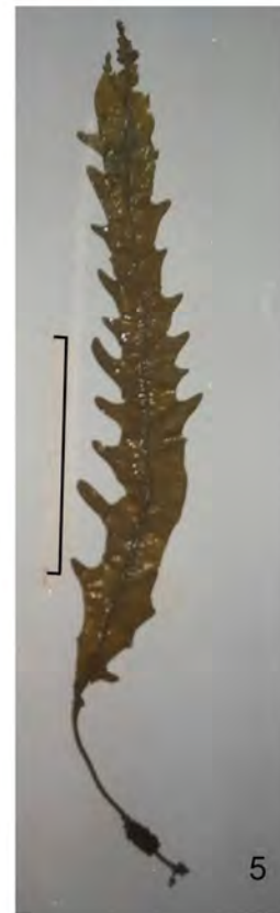
Figures 1 – 5. 1) Undaria pinnatifida f. distans , collected in Golfo Nuevo, Argentina; scale: 20 cm. (Photo: G. Casas). 2) Undaria pinnatifida f. típica ; scale: 15 cm. (Photo: G. Casas). 3) Undaria pinnatifida aff. f. narutensis , see arrow showing the sporophyll spread over the lowest side of the blade; scale: 20 cm. (Photo: G. Casas). 4) Morphotype similar to Undaria undarioides ; scale: 2 cm, collected in Golfo Nuevo in spring-summer (kindly given by Seaweed Herbarium of Cenpat - CONICET). 5) Form called “aberrant”, collected in Golfo Nuevo: small form elongated; scale: 20 cm. See incipient sporophyll in the lowest third of stipe, resembling the f. distans (kindly given by Seaweed Herbarium Collection. Cenpat - CONICET).