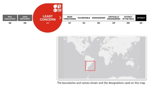
Compiled by: IUCN SSC Shark Specialist Group 2018