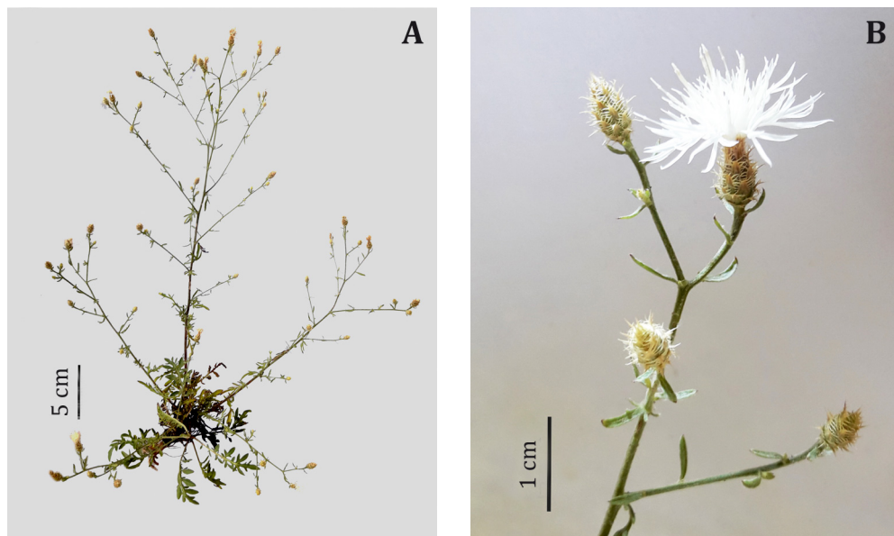
Figure 1. C. diffusa specimen collected in the Uspallata Valley and deposited in the MERL herbarium (IADIZA, CONICET - Mendoza).

A: plant. B: detail of branch with flowers. C: fruit. D: involucre bracts, 1) internal, 2) middle, 3) external.