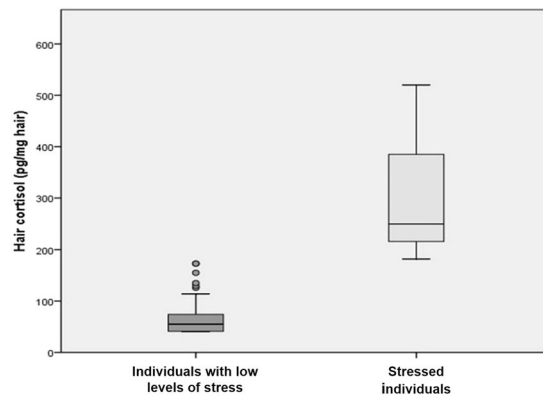
Figure 3. Hair cortisol concentration in stressed and individuals with low levels of stress. Hair cortisol levels in healthy individuals with low levels of stress (40–128 pg/mg; n = 213) and in stressed individuals (182–520 pg/mg; n = 19); p < 0.05 .

The procedure presented in this study was compared with MS, verifying the presence of cortisol in the samples after the extractive procedure described for automated analysis. Moreover, those hair samples, measured by the proposed automated method, with cortisol concentrations below LOQ were also not detected by MS.