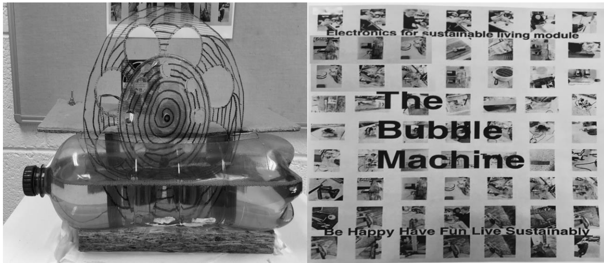
Figure 2. Bubble making machine using eco-friendly washing up liquid and dual motor system