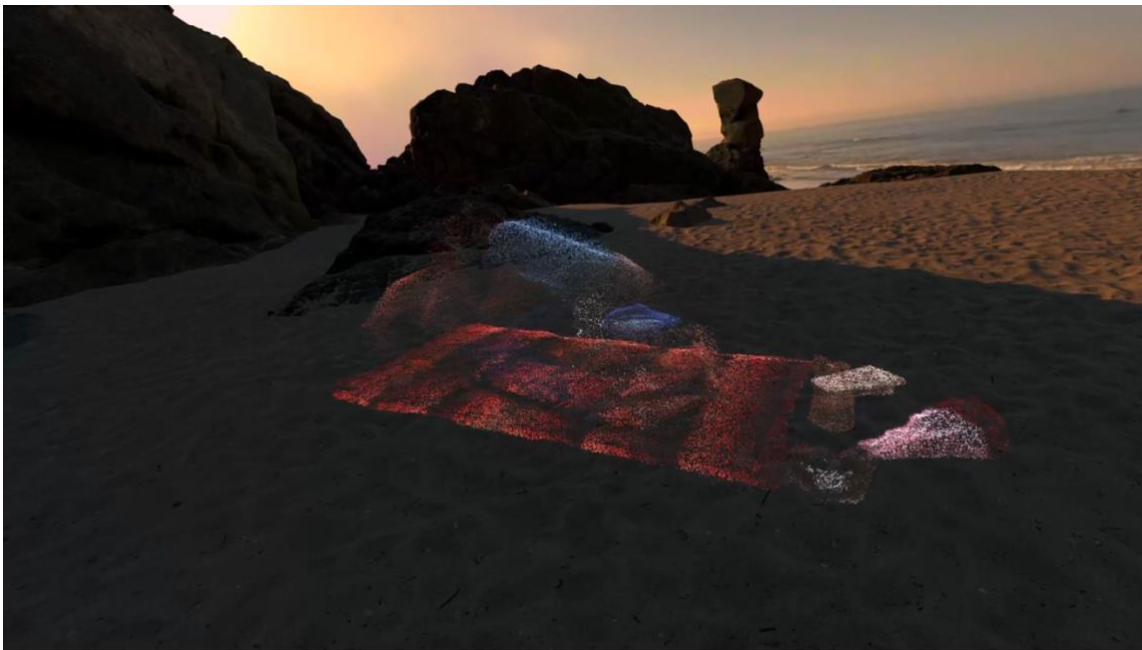
Figure 6: Colourful dots create a pointillistic visualisation of memory in Ark . Screenshot.