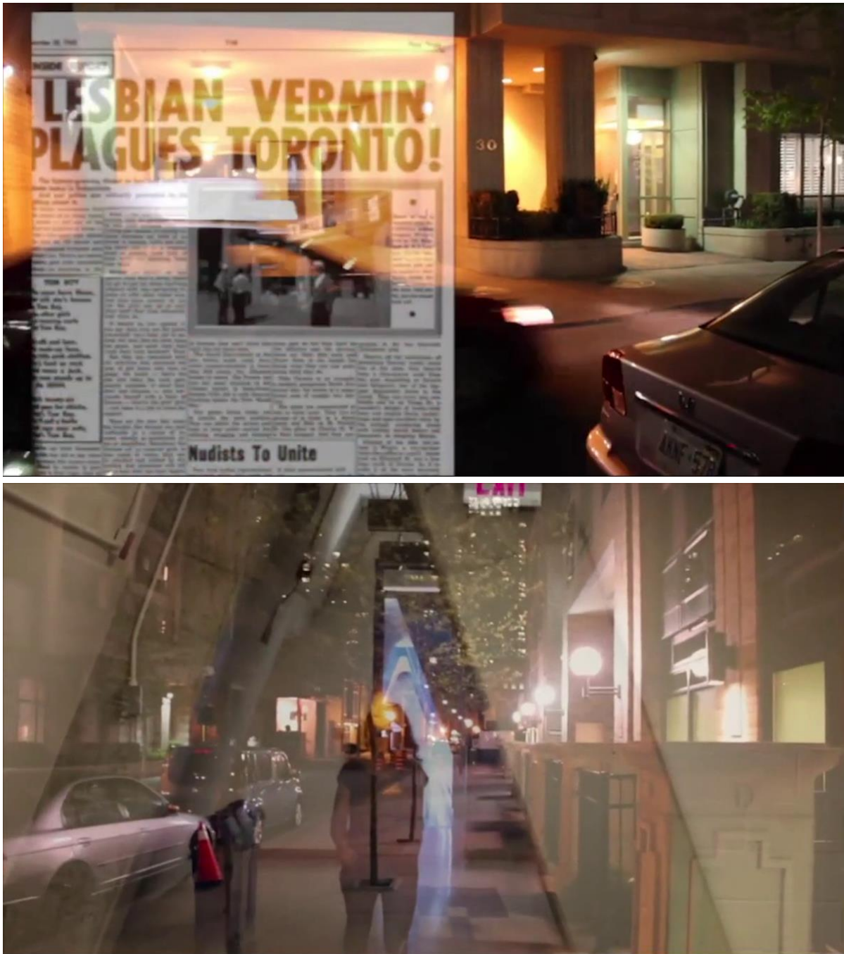
Figure 4 (above): Archival material attesting towards Toronto’s queer subculture in Chez Moi . Figure 5 (below): Vaginal shapes give form to the atmosphere of the Chez in Chez Moi . Screenshots.

Chez Moi creates new cultural markers in a specific place and reorients our practice of space towards non-normative narratives. While some visual elements may differentiate the three space-times in the video (such as the momentary road works at the beginning of the video), most of the geometry and street buildings will remain unchanged. This has the effect of merging the space of the diegesis (1980s Toronto) and the time of production (2014) with the present space-time of the viewer. The rhythm of Fisher’s voiceover and the sound of footsteps that resonate in several instances in the artwork dictate the pace of the viewer as they walk the street and watch their screen. The journey in time and space provides what Shira Chess would recognise as “queer pleasure”, through a narrative—and ideally also physical—immersion in a past time and space. 4