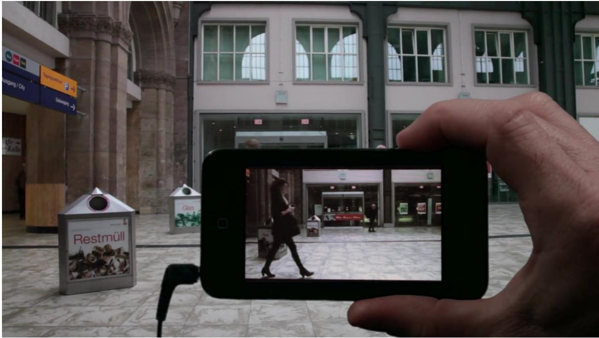
Figure 1: Mobile technologies merge actual and digital spaces in one image in Alter Bahnhof Video Walk (Janet Cardiff and George Bures Miller, 2012). Screenshot.

Chez Moi calls on the user/viewer to imagine how the lesbians of Toronto in the 1980s met and found themselves a home. Katherine Cook terms this kind of activist and political work “queer archaeologies”: the “strategic applications of technologies and media to defy, to confront, to derail, to remix”, and “reconfigur[e] structures of engagement [and] intimacy” (402). The AR piece combines Fisher’s oral storytelling with an assemblage of news reports, archival and fictitious sounds and images in a subversive way that reminds the viewer of the documentary genre and of media archaeology.