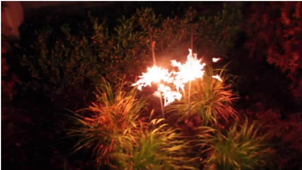
Figure 3: The camera creates abstractions through lingering on objects in close-up. Chez Moi . Screenshot.

Hearing naturally becomes the primary sense when watching a video and walking in urban streets, due to the omnipresence and multidirectionality of sound compared to the focus that sight requires, a phenomenon that the immersive power of headphones strengthens. The proliferation of ambient sounds in the video—of traffic, steps, chatting, and moaning—gives life to the Chez and merges with the viewer’s kinaesthetic and visual experience of their physical environment. Similarly, images in the video increasingly lose their reference to concrete elements in the story, and instead become abstract symbols of an atmosphere as the camera lingers on details and creates close-ups on carefully chosen objects seemingly left onto the street—such as an old movie ticket, a red high-heel shoe, and sparkler candles (Figure 3).