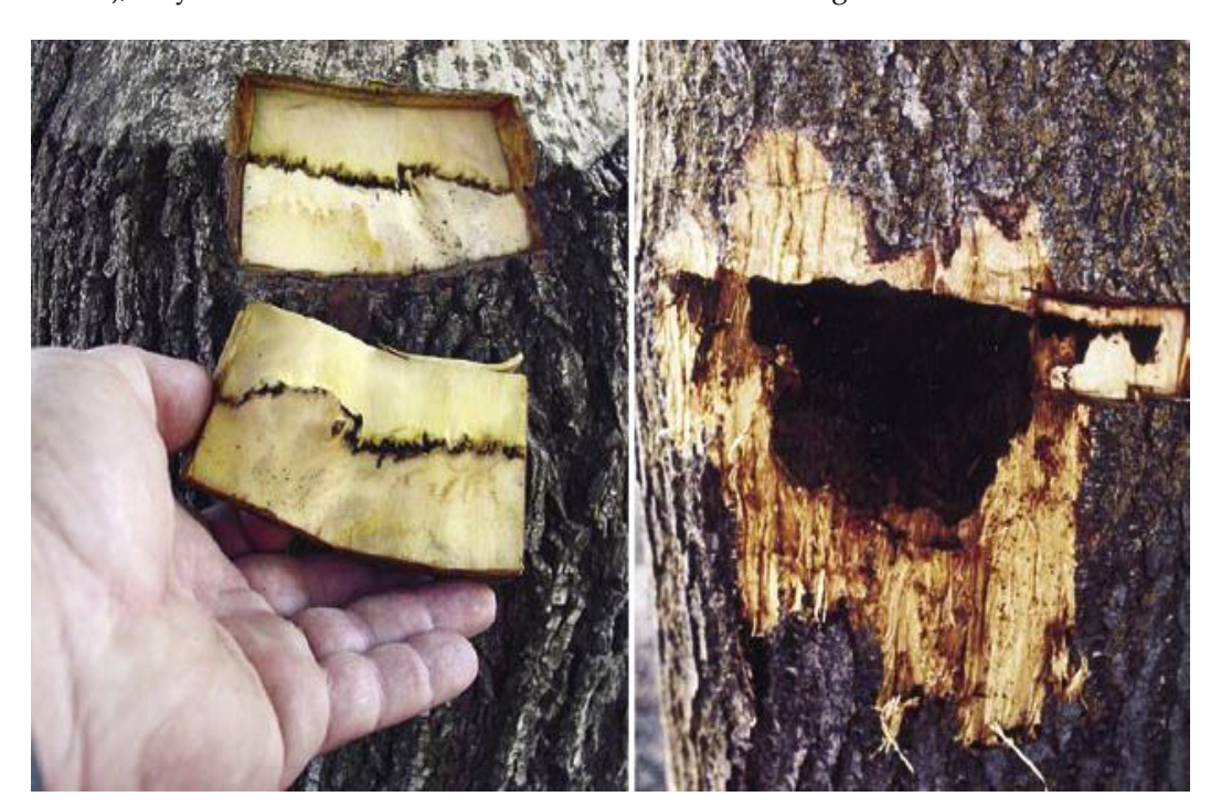
Figure 1. Symptoms of blackline disease in walnut at graft union.

pollen-borne virus enters through flowers during pollination and is systemically transported to the graft union. The resulting hypersensitive reaction of the rootstock and death of tissue at the graft union blocks nutrient and water transport between the rootstock and scion [61]. The hypersensitive response to this virus is controlled by a single dominant gene ( R gene) [240]. To develop CLRV-resistant scion cultivars capable of blocking the virus at the pistillate flower and/or movement toward the graft union, a breeding program was initiated in 1984 the University of California-Davis (UC-Davis) to backcross resistance from Paradox into scion cultivars with commercially acceptable horticultural traits. This program is still ongoing [240]. A DNA marker related to CLRV-resistance that maps to ~6.2 Mb on chromosome 14 has been developed in order to accelerate selection of CLRV-resistant offspring [242-245]. In continuation of work started by E. Germain (INRA-Bordeaux), a hybrid resistant to blackline is in evaluation to be registered in France.