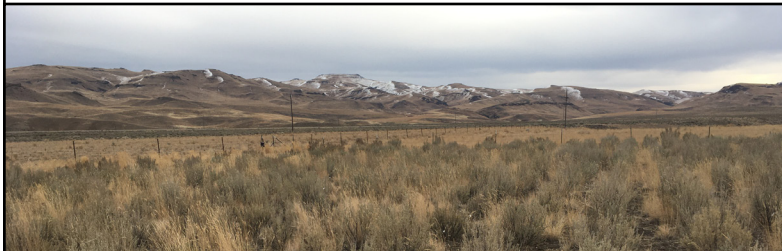
Figure 1. Image of Soda location in fall 2020 provided by Andrii Zaiats.