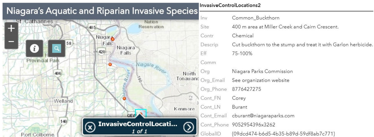
Figure 3. Screenshots of map and pop-up box. The map shows where aquatic and riparian invasive species are being controlled in the Niagara region. When users click on a point, a pop-up box appears displaying information on the invasive species being controlled, the type of control, control effectiveness, and contact information.

Practically, this forms a foundation and baseline for the current state of aquatic and riparian invasive species management initiatives in the Niagara region. This database already has an international presence since the official websites of several major organizations in Canada and the U.S. have added links to this study's database, including the Environmental Protection Agency (EPA) ( https://www.epa.gov/greatlakes/invasive-species-great-lakes ), USDA ( https://www.invasivespeciesinfo.gov/resources-indexed?f%5B0%5D=field_location%3A163&page=9 ), NOAA ( https://www.glerl.noaa.gov/glansis/additionalResourcesPartners.html ), Invasive Species Centre ( https://www.invasivespeciescentre.ca/ ), and the Canadian Council of Invasive Species ( https://canadainvasives.ca/programs/resources/ ). Databases can operate at different spatial scales with the role of local databases being to create richer and more accurate global database network (Simpson et al. 2009). The Niagara Aquatic and Riparian Invasive Species Control Database is now a part of the global information network on invasive species made up of over 150 databases (Ricciardi et al. 2000; Sellers 2004; Deriu et al. 2017).