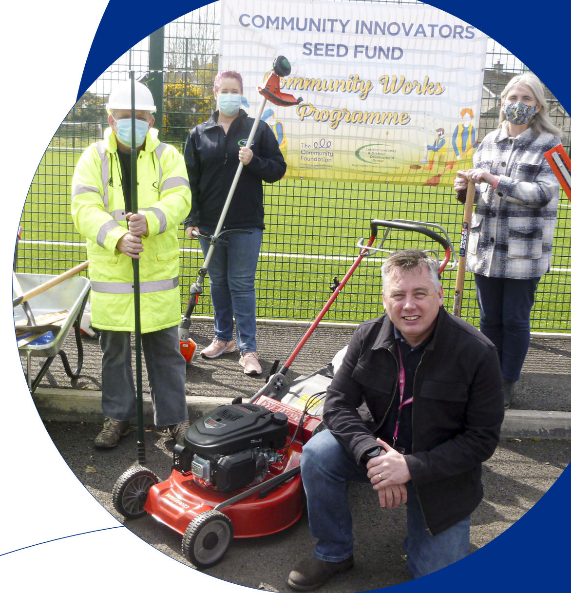
Lettershandoney & District Development Group received funding from the Community Foundation for Northern Ireland towards upskilling and delivering a Rural Works programme to provide new opportunities for young adults and rural communities within their locality.

These examples are just a snapshot of the work happening across the community foundation network.