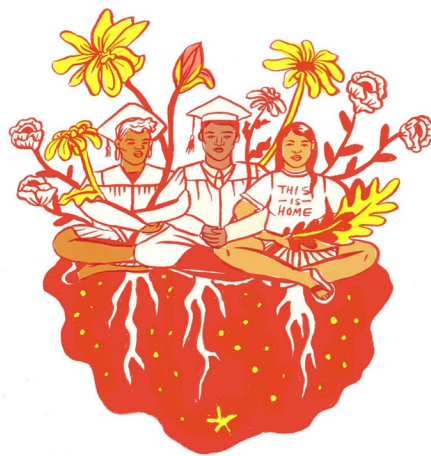
Artwork by Ashley Lukashevsky for Amplifier.org, a design lab using art to amplify voices of grassroots movements

“Rapid response funding is important but not enough. If we don’t also address systemic issues, the other side wins.”