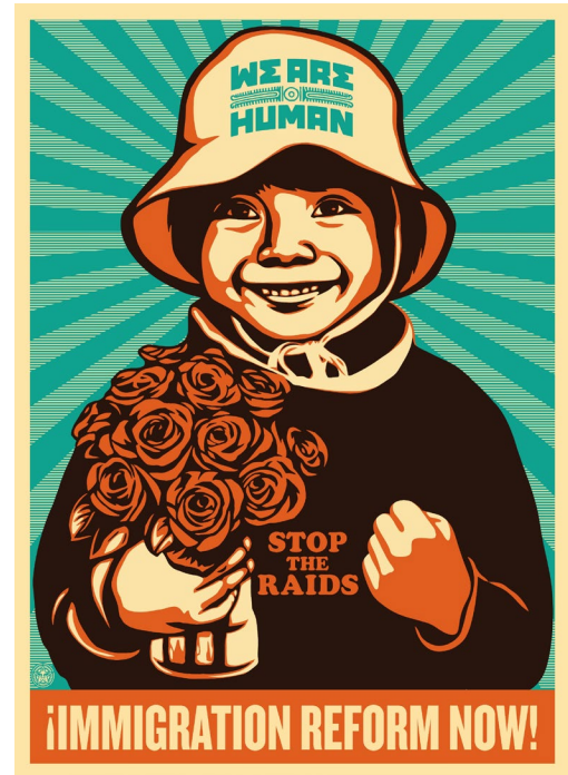
Artwork by Ernesto Yerena for Amplifier.org, a design lab using art to amplify voices of grassroots

To better understand the effect of rapid response grantmaking and the current landscape for immigrant integration in California, The Foundation commissioned this practice brief to explore the various ways California foundations are contributing to a pro-immigrant movement. It is based on a developmental evaluation of The Foundation's Protecting Immigrant Rights (PIR) efforts and interviews with 12 foundations and immigrant rights organizations. It seeks to