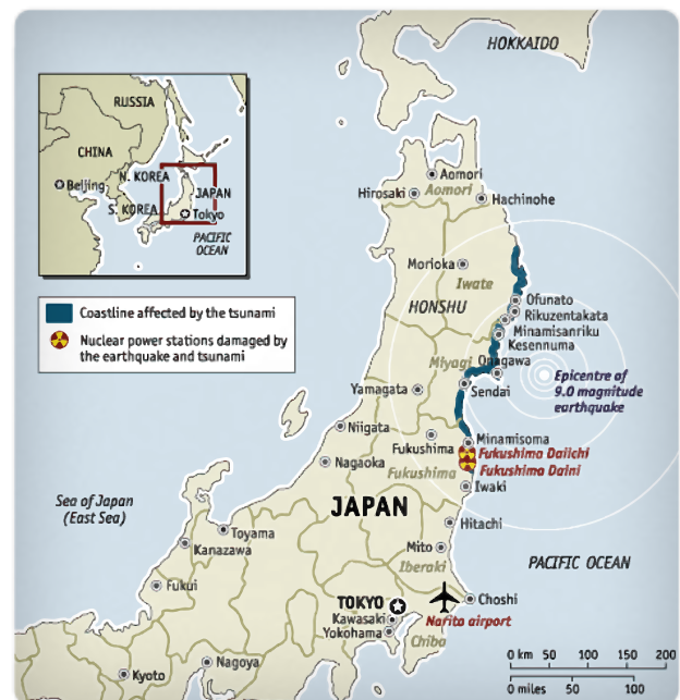
Location of earthquake, tsunami and affected nuclear power plants.

However, having invested billions of dollars in earthquake resiliency measures since 1995's Great Hanshin-Awaji or Kobe earthquake, which killed over 6,000 people, Japan is also considered a world leader in disaster preparedness. 18