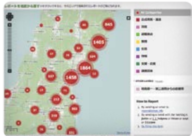
Screenshot of the sinsai.info disaster map. In English the motto below says the map was created by everyone, similar to open source.

Following on from the Haiti earthquake of 2010, the volunteer technical community raced to map messages from the disaster zone. And within four hours of the earthquake, Japan's version of the Ushahidi crisis map, sinsai.info , meaning "disaster info", had also been created. 99