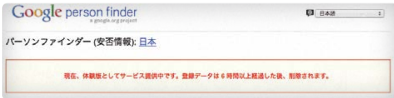
Screenshot of Google Person Finder's website

in the Philippines in August 2012. 90 Within hours of the 7.3 magnitude earthquake that struck Japan on December 7, 2012, Twitter Japan recommended hash tags for those wanting to follow news or discuss that earthquake. 91