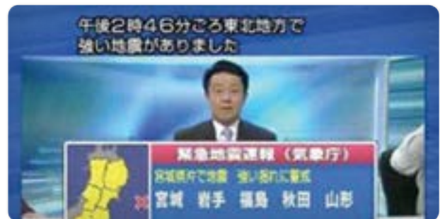
Japan's public broadcaster NHK announces an earthquake in the Tohoku region on March 11, 2011.

On March 11, 2011, the JMA detected powerful seismic tremors and sent an automatic earthquake