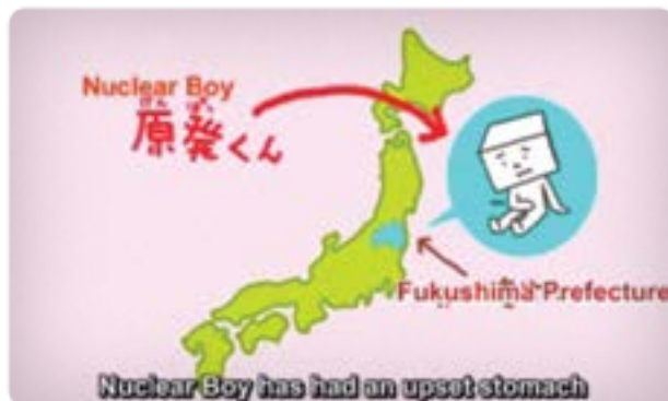
Screenshot of Nuclear Boy, animated cartoon explaining the Fukushima nuclear threat

YouTube also served as a channel for requesting assistance. The most notable appeal came from within the Fukushima evacuation zone, where the mayor of Minami-Soma city made a desperate plea for volunteers and relief supplies. The video had almost half a million views. 82 According to the newspaper, The Japan Times, the video resulted in truckloads of relief supplies and international media coverage and prompted apologetic phone calls from government officials and TEPCO. 83