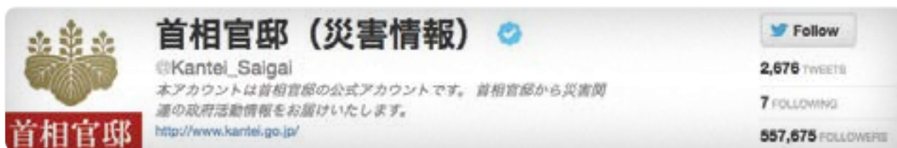
A screenshot of the Japanese PM's Office's Twitter account in 2012

In response to the grass-roots movement to create disaster-specific hash tags, Twitter Japan (@twj) sent a tweet summarising the most popular hash tags on March 12. Later they also published a blog that outlined the most used hash tags for different purposes and contained links to official disaster information sources. 70 The most popular hash tags included: #anpi (for finding people) and #hinan (for evacuation centre information) as well as #jishin (earthquake information).