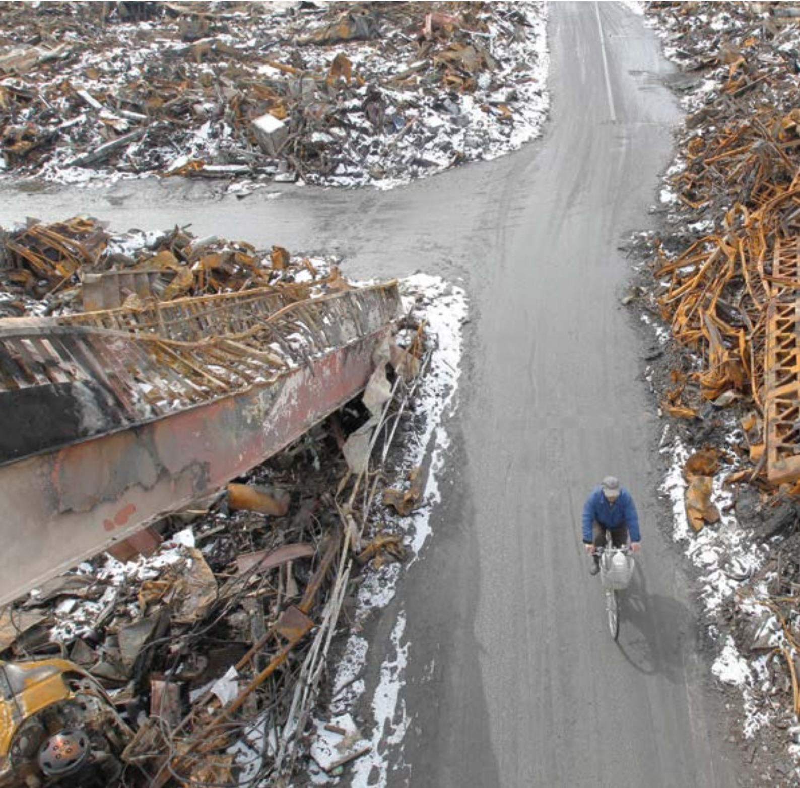
A man rides a bicycle at an area hit by earthquake and tsunami in Kesennuma, north Japan, March 17, 2011.

The country also has a high internet and mobile penetration rate; statistics show that 80 percent of the population are internet users with around 84 percent using mobile phones. 20 However, Japan also has the world's most rapidly ageing population, with 24 percent over 65 years old. 21