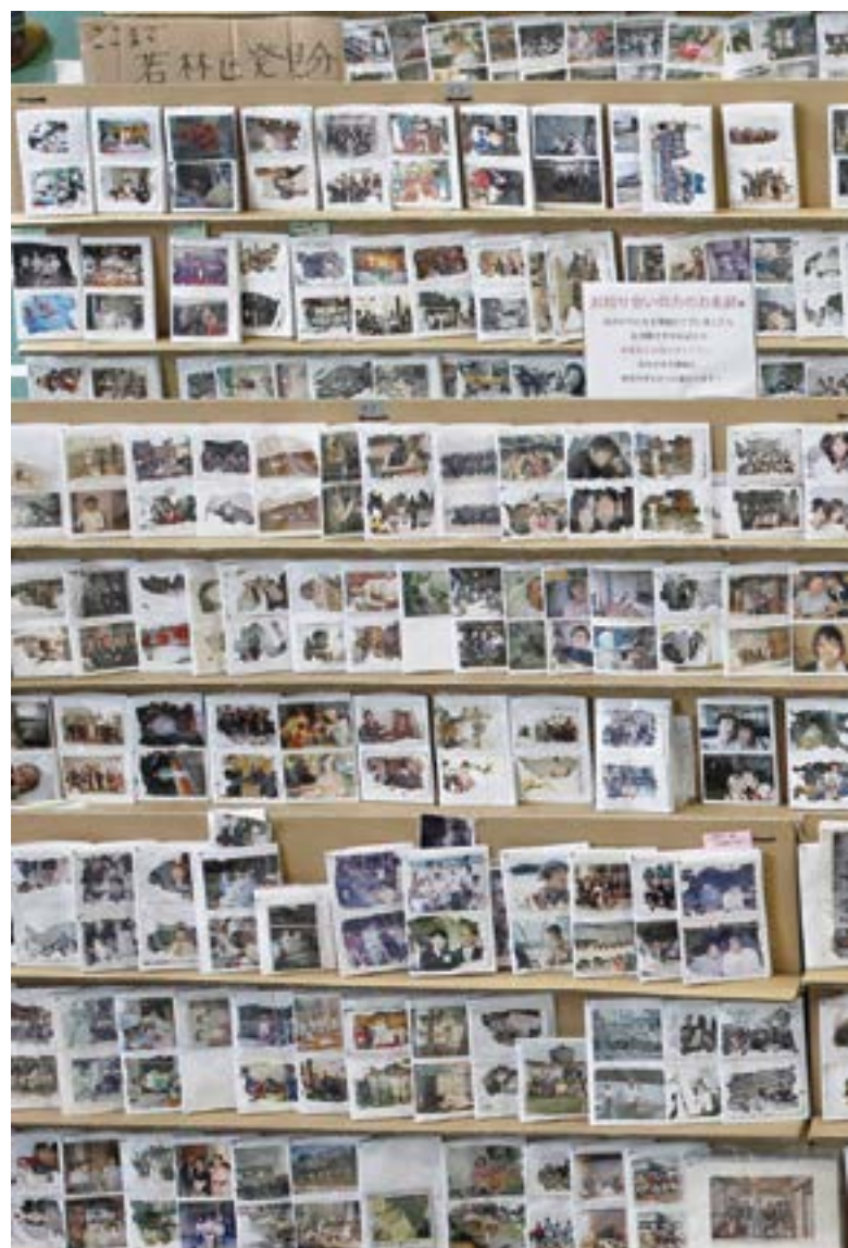
A man looks for his photographs at a collection centre for items which were found in the rubble of an area devastated by the March 11, 2011 earthquake and tsunami in Sendai, Miyagi prefecture March 9, 2012, ahead of the one-year anniversary of March 11, 2011, earthquake and tsunami. More than 250,000 photographs and personal belongings are displayed at the centre for owners to recover.

Shortly after the tsunami, the Japanese government began producing regular situation updates in Japanese, but little humanitarian information was