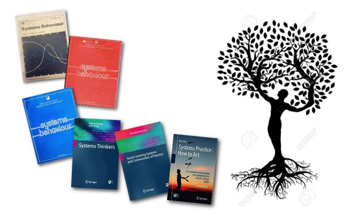
Figure 2. A long lineage of high quality teaching materials and research-derived scholarship beginning with Systems Behaviour, the first Systems course or module developed at the OU until current times - books co-published with Springer as part of the STiP PG programme.

infancy. From these beginnings, internationally recognised cyber-systemic teaching materials, scholarship and research and transformative learning have been produced for over 50 years.