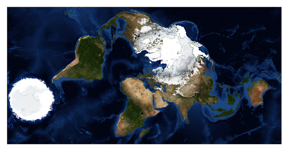
Figure 1: Map of snow and ice covered surfaces (white) on Earth during Northern and Southern Hemisphere winters combined from NASA's Blue Marble collection, with Northern Hemisphere sea ice extent from the National Snow and Ice Data center. The map projection is described in Grieger (2019), which shows Antarctica and the Arctic region with only small spatial distortions. DOI: https://doi.org/10.1525/elementa.396.f1

The cryosphere is rapidly changing as a consequence of global and regional climate change (Vaughan et al., 2013). Both the spatial extent and thickness of Arctic sea ice has drastically declined in the past 40 years. The large polar ice sheets and lower-latitude glaciers are losing mass at unprecedented rates (Vaughan et al., 2013). The spatial extent and duration of seasonal snow cover in the Arctic