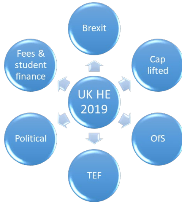
Figure 2.0: Factors Currently Affecting UK HE: