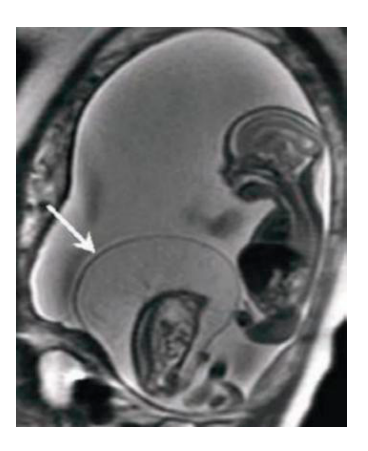
Figure 1. Fetal magnetic resonance imaging (MRI) of Twin reversed arterial perfusion (TRAP) sequence. Half-Fourier Acquisition Single-Shot Turbo-Spin-Echo (HASTE) T2 Sag. Both the acardiac (signaled by the arrow) and pump twins are visible.

of view, between the placenta, the amniotic fluid, and the fetuses, which, being structures with different tissue compositions, show a different signal intensity in response to the radio frequency (RF) stimulus (Figure 1).