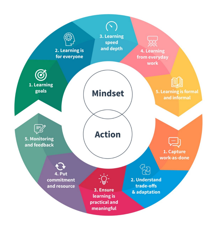
Figure 1 The CIEHF framework for organizational learning.

The pressure on healthcare organizations has led to the rapid adoption of containment measures largely based on imitation of compliant behaviours immediately embedded into the routine activity. The impact of COVID-19 on elective surgery set a benchmark during the 'acute phase' useful to manage the 'transition phase' [32].