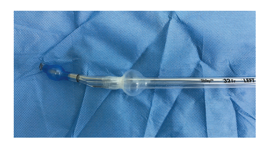
Figure 2 The modified 32 Fr left double-lumen tube. The distal end of the tracheal cuff was wrapped with the 3M Tegaderm transparent film.

The chest computed tomography scan showed a soft tissue shadow and thickened wall in lower part of the trachea and the right main bronchus ( Figure 1A,B ). The bronchoscopy revealed a tumour encroaching into the terminal trachea and right main bronchus ( Figure 1C ) that has been a biopsy proven mucoepidermoid carcinoma. To better preserve the pulmonary function, right upper sleeve lobectomy and carinal resection and reconstruction under uniportal VATS was planned for this patient.