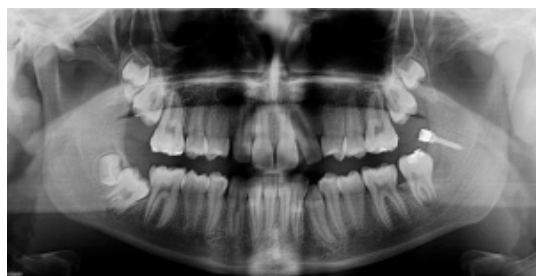
Figure 3. Post-treatment panoramic radiograph showing the correct inclination of 3.7 before miniscrew removal.

The MM2 was considered upright when the mesial marginal ridge was above the distal contours of first mandibular molar (MM1) (Figure 3).