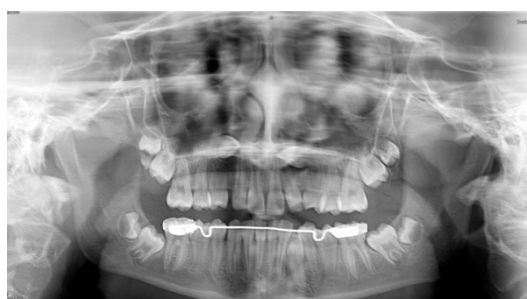
Figure 1. Pretreatment panoramic radiograph showing bilaterally impacted MM2 and upper canines.

The panoramic radiograph showed the presence of several impacted teeth (Figure 1). Angle of inclination of MM2 was measured, as described by Evans [17]. The angle of the left MM2 was 30°, the angle of the right MM2 was 40°. Cephalometric measurements were performed using lateral cephalometric radiography that showed a Class I skeletal relationship (ANB = 2°), brachyfacial growth pattern (MP-SN = 30.5°; FMA = 17.5°) and palatal inclination of the upper incisors (U1—ANS-PNS = 107.0°).