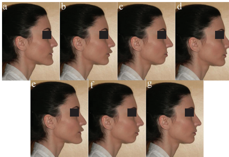
Fig. 3: a) Prognathic mandible of 4 mm; b) Prognathic maxilla of 4 mm; c) Bimaxillary dentoalveolar retrusion of 4 mm; d) Retrognathic maxilla of 2 mm; e) Bimaxillary dentoalveolar protrusion of 4 mm; f) Retrognathic mandible of 4 mm; g) Retrognathic mandible of 2 mm.

graphic characteristics of the study sample are described in Table 2. The mean values assigned by all examiners were considered and the differences between the four categories (O, DS, OP, SOP) (Table 3), among gender (F-M) (Table 4) and age (<17years; >17years) (Table 5) were determined.