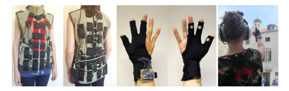
Fig. 3. Mixed reality cues and affordances can be provided through haptic user interfaces: (a) the vest; (b) the glove; and (c) audio-haptic exploration, in which an MRUE user points at a POI with the haptic glove and listens to the associated audio description.

We deployed aural and tactile channels as a complement to the visual channel into the system. Eyes-free interaction techniques avoid drawing users' attention onto the interface, enabling higher awareness on the surroundings and less concern of safety. For example, we developed a vibrotactile vest (Fig. 3a) that offers a hands- and eyes-