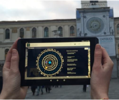
Fig. 4. Mixed reality cues and affordances through computer-vision-based AR provide visual augmentations of a POI. (a) The AR visualization points the user to relevant objects, which he or she can select for detailed information. A green icon indicates that animated content is associated with the astronomical clock. Next to the center, an abstract visualization indicates a cluster of search results, including the overall amount and the type encoded in color. The reticle in the center of the screen can be used to aim at POI icons by moving the tablet. When the reticle matches with a POI, users can tap with the thumb on the target button on the edge of the screen to confirm selection. (b) The animated explanation of the astronomical clock.

While we enable precise spatial registration of annotations to POI in the environment, we cannot simply place the annotation exactly over the POI. Finding a good placement of object annotations in a visual display is difficult, since a clutter must be avoided. A common approach is to choose locations such that a minimum number of salient objects are occluded. Such view management is commonly done by computing force fields [40] that repel annotations from important objects. Unfortunately, this force field must be computed for every frame, such that the chosen locations do not suddenly change and the annotations appear to jump erroneously. Our coherent view management [17] evaluates the force field in 3D space, even though a 2D image layout is finally computed. This move to a higher dimension makes sure a temporally continuous motion emerges, where annotations naturally follow the objects they are assigned to. We also reliably suppress clutter by restricting the maximum annotation density on the display. If the POI list from the recommendation engine is too long and does not comfortably fit on the screen, conventional view management works by just omitting low-ranking annotations, making serendipitous discovery impossible. Adaptive view management [21] folds similar annotations of low importance into a single "group" POI, which initially takes less space but can be unfolded by the user on demand. This feature supports the creation of mixed reality