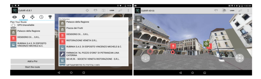
Fig. 2. (a) Itinerary building. Recommended POIs can be selected to create a custom path. (b) Virtual Exploration.

A subset of POI locations retrieved by the recommendation engine can be selected and used to create a customized itinerary (Fig. 2a). The itinerary is built with the help of an external routing service (Nokia). However, regular wayfinding is replaced by a joint space-time optimization concerning the recommended POI locations: Which set of POI locations could be visited this morning? and Which area of the city should be visited today? As an alternative, our system provides itineraries curated by professional tour guides, which highlight a topic of the urban environment (e.g., religious places, art museums, famous nightlife places, or restaurants) or tell a story (e.g., life of Galilei). None of these itineraries force a visitor to follow the suggested path. Instead, the itinerary is merely an initial suggestion, from which the visitor can divert and return to afterwards. Visual or haptic cues regarding the location of the next POI to be visited can be provided as requested by the visitor.