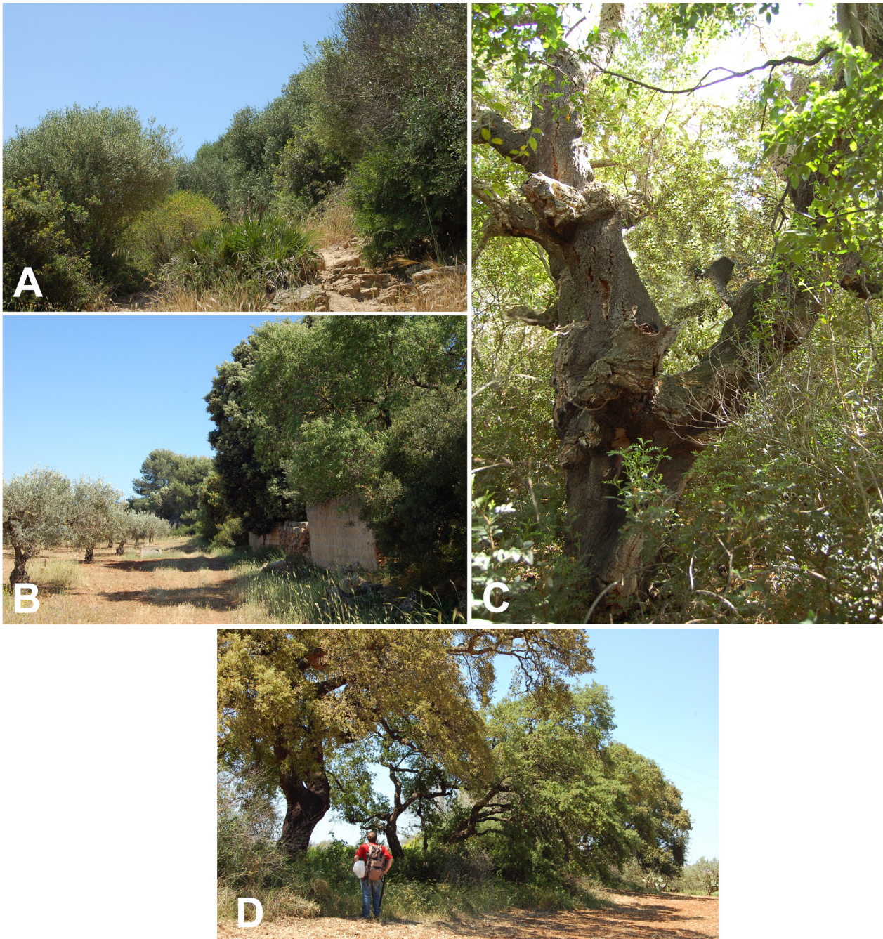
Figure 5. A, Evergreen maquis-forest nucleus referred to the Chamaeropo humilis-Oleetum sylvestris acanthetosum mollis (Habitat 9320) (photo: L. Gianguzzi, May 9, 2007); B, Forest nucleus dominated by Quercus ilex (Habitat 9340) (photo: L. Gianguzzi, May 9, 2007); C, Century-old tree of Quercus suber (photo: L. Gianguzzi, May 9, 2007); D, Forest strip dominated by Quercus suber (Habitat 9330) (photo: L. Gianguzzi, May 9, 2007).

munity described from the Erei Mounts (southeastern Sicily: Barbagallo 1983; Brullo et al. 2009 and references therein). Even if the main characteristic species of this association, i.e. Aristella bromoides (L.) Bertol. – also known as Stipa bromoides L. – was not observed in the study area, it has been recently reported to occur at Menfi and Castelvetrano (Scuderi and Pasta 2009) in other remnant fragments of open forestland once covering the Basso Belice lowland (see Table 6, relevé 3, from Scuderi 2006).