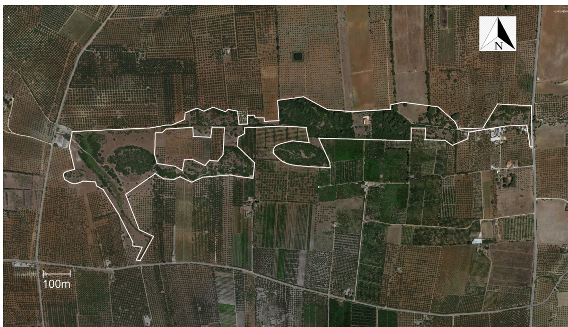
Figure 2. The site of ‘Parche di Bilello’. White line = perimeter of the area where the floristic inventory was carried out; its protection as a new Site of Community Interest is here recommended.