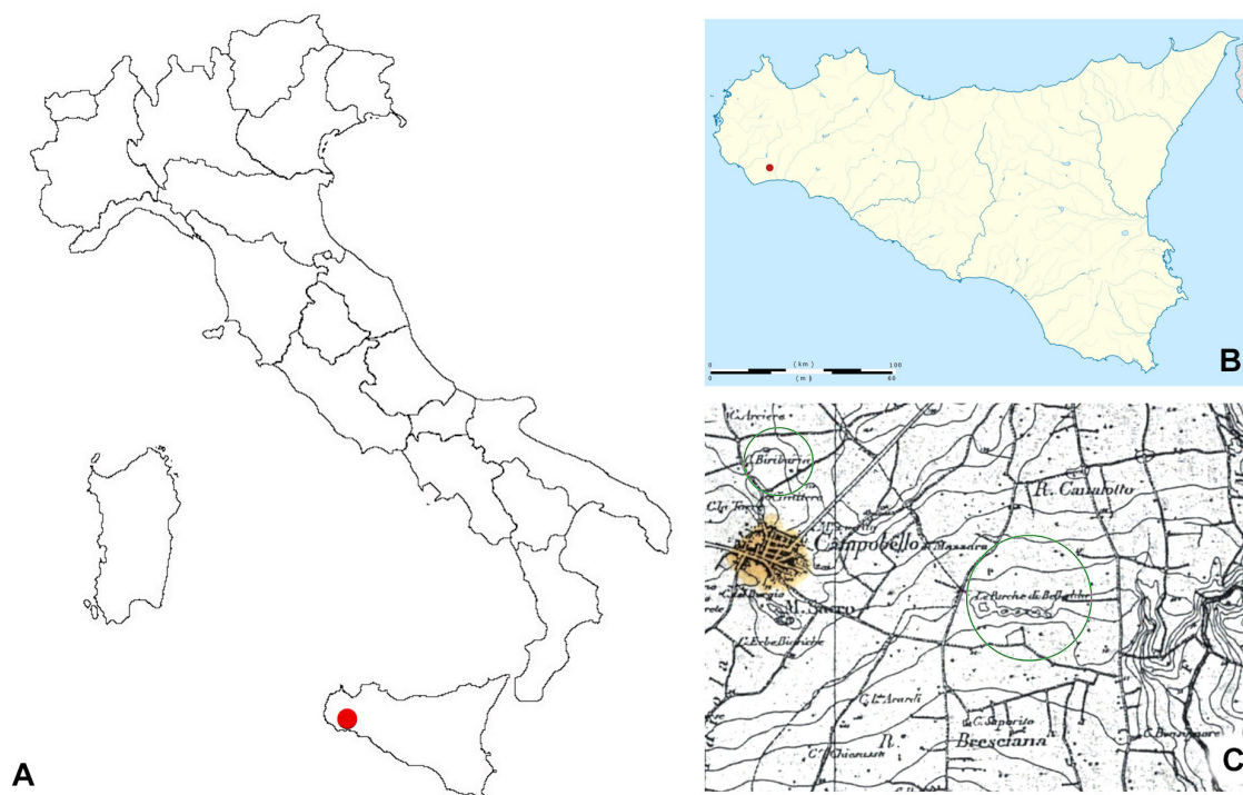
Figure 1. Location of the study area with respect to Italian (A) and Sicilian (B) territory; C) the study area and its close surroundings: particular from ITMI (1872, original scale 1:100,000).

The almost flat coastal landscapes between Sciacca and Marsala are usually called Sciare, a vernacular term which seems to derive from the Arab word 'sha'raa' (= sterile and uncultivated area). Agricultural activities are difficult here due to poor soil availability. The term 'Sciare' has been broadly used to indicate local karst flatlands, characterized by a mosaic of outcropping calcareous rocks and sandy-loamy shallow lithosols supporting a mosaic-like patchwork of thermo-xerophilous vegetation including therophytic swards, perennial dry grasslands, garrigues and low maquis. The Sciare also host several small temporary ponds and rock pools rich in hygrophilous and