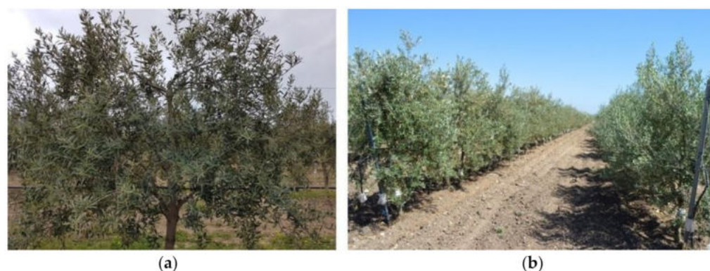
Figure 2. Example of high-density “pedestrian olive orchard” in southern Sicily: (a) “Calatina” olive tree trained to “free palmette”; (b) continuous walls of “Calatina” trees trained to “free palmette”.

After more than 15 years of trials with a wide array of Sicilian cultivars with different vigor, growth and fruiting habits, the results obtained with this new type of planting, which we call “pedestrian olive orchard” similar to fruit crops, are definitely interesting; hence, the cultivation model is to be considered mature to be further investigated. From recent trials with a selected number of major and minor Sicilian genotypes, low vigor cultivars that are early fruiting, highly productive, with flexible, weeping branches have resulted in the most suitable for high-density pedestrian olive orchards. For example, minor cultivars like Calatina planted at 5 \times 2 m have reported more than twice the yield efficiency (in kg of olives per m^3 of canopy) and yield per ha compared to major cultivars like Nocellara del Belice (Caruso, unpublished data) over the first six years from planting. It is, therefore, generally believed that in the various olive-growing areas of the world, the model should be developed with low vigor, native cultivars to be more easily transferred to growers with specific indications on the cultivation protocols to be followed in particular pruning, fertilizing, and irrigation. In short, it is a matter of developing, starting from the aforementioned reference model, plantings suitable for specific regional/district areas and this unlike super-intensive plantings, which are based on cultivars with global agronomic potential.