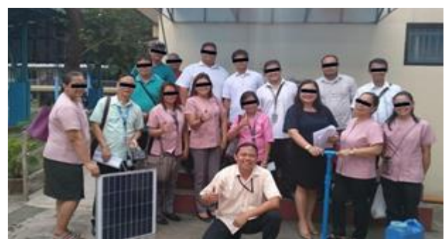
Figure 6: Training of principals and teachers for WELS pre-positioning in schools

Twenty schools in Marikina and San Mateo (NCR) had pre-positioned WELS units. WELS with solar powering provision was attached to the school’s tap water or rain catcher. There were frequent occurrences of heavy monsoon rains in the past that caused flash flood in these areas. Affected families were displaced and temporarily sheltered in schools, which served as evacuation centers. When we installed WELS immediately after a flash flood incident, school principals saw the wisdom of having them as pre-positioned assets. When schools turn to evacuation centers again, they can readily provide drinking water even if municipal water gets contaminated and the electricity service is disrupted. On regular schooldays, it gives additional cleaning and disinfecting to students’ drinking stations. Principals and teachers, though non-technical, attend hands-on training to facilitate WELS installation in their respective schools. Figure 6 shows participants representing nine schools in Marikina City.