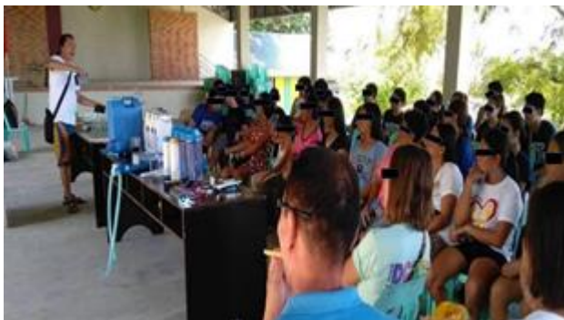
Figure 11: Hands-on training educates the community

In every site, hands-on training is a must before and after installation. With or without technical know-how, recipients go through training to learn about the system's installation, operations and maintenance procedures.