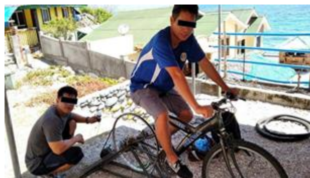
Figure 4: Pedal-powered alternator installed at Isla Verde, Batangas

Over the years several new strategies for cleaning rainwater evolved. Realizing it takes only a motorcycle battery to clean water, portable water cleaning stations are viable. The entrepreneur takes the complete system to homes with stored water and cleans 50 liters or more in 15 minutes for a small charge. Twenty or more homes can be serviced this way with one battery. In Isla Verde, WELS operates daily. Since the key to this system is stored energy that can be transported, we developed a battery-charging system using a bicycle that can be used 24/7. We see a demonstration of this system in Figure 4.