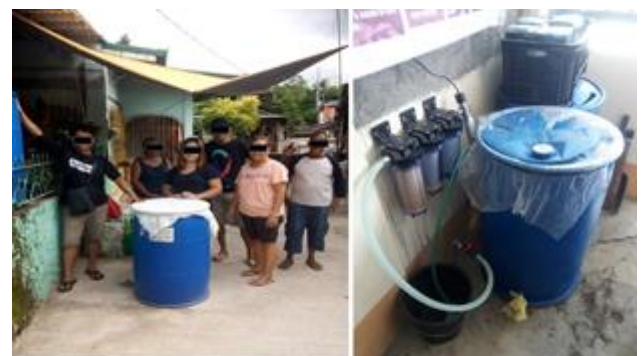
Figure 13: Improvised rainwater collection using tarpaulin and drum

For installation sites with livestock nearby or where roof is prone to bird droppings, tarpaulin is used as water collection tool. When it starts to rain, tarpaulin that was kept inside the house is cleaned and spread out to catch rainwater directly from the sky, not from the roof's downspout, then pour water down into a drum. This approach is seen in Figure 13.