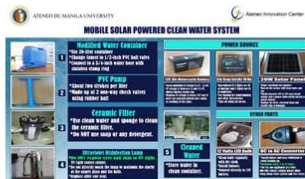
Figure 8: First reference poster used during trainings

All WELS installations included training in system operation, maintenance, and repair with complete materials list. A tarpaulin showing the components and maintenance procedures, together with the installer's contact details, was also posted in the installation site for easy reference. A sample of the reference poster made for the initial trainings is in Figure 8. This eventually improved to include more pertinent details like installer's contact information and QR code access for updates about the technology.