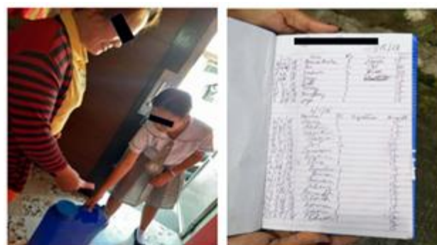
Figure 3: Water selling business (showing list of sales) in Pandi (Bulacan) leads to sustainability

lamp) is operating, it means the water is super clean”. Bigger filters were installed in a residential house in Novaliches that used brownish ground water for laundry which caused discoloration to their clothes. When WELS was connected, water became clear and no more discoloration was experienced. In Pandi (Bulacan) relocation site, water distribution follows a schedule. The presence of WELS gave greater access to drinking water and an alternative source of livelihood. A homeowner and WELS recipient in Pandi reported that she made a business out of WELS by selling drinking water to neighboring communities. The university-recommended business model of selling cleaned water supports sustainability of the system and a return of investment for the entrepreneur in six months. Shown in Figure 3 is the thriving water selling business in Pandi, Bulacan.