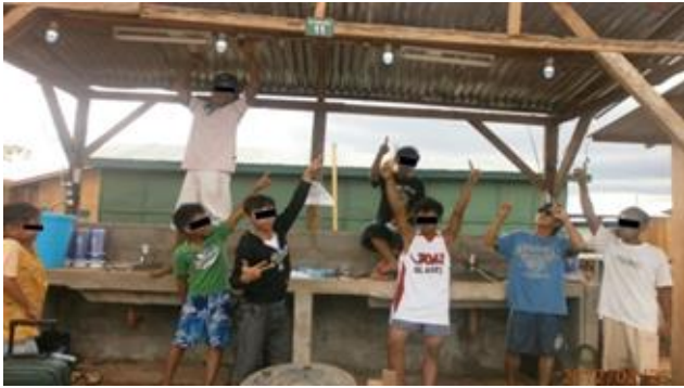
Figure 10: Youth installed WELS in a relocation site's common kitchen facility

common kitchen facility. The youth's confidence in installing the system was evident as seen in Figure 10.