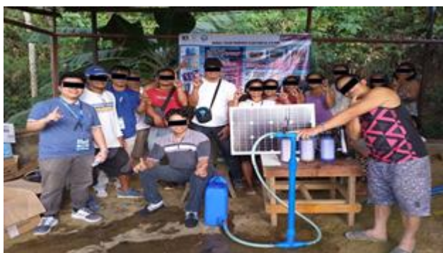
Figure 14: Do-it-yourself PVC pump to clean water from any container

Figure 14. With the use of DIY pump, WELS can circulate in the community and clean water from any clean container.