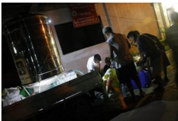
Figure 5: Nighttime installation in post-disaster Cagayan de Oro