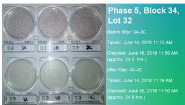
Figure 2: Water test kits showing results of contaminated (above) and cleaned water (below) in one installation site

In the NCR where electricity and tap water are available, only the WELS filtration and disinfection components were used in many residential houses. For drinking water consumption of babies and the elderlies, city dwellers buy distilled water by the liter/gallon. Connecting the 3-stage filtration system with UV lamp to the household faucet assured very clean water. This new appreciation of UV disinfection was expressed by many, especially pregnant women, as they say, “Make sure the blue light (from UV