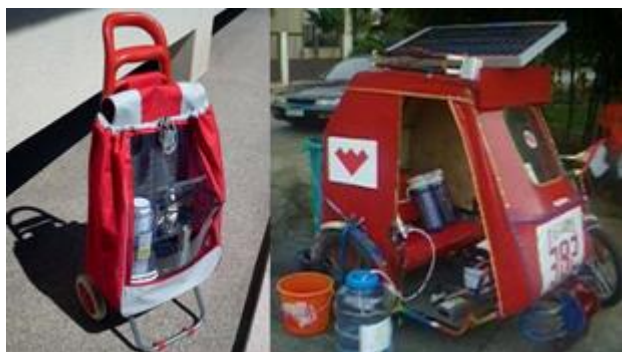
Figure 15: Clean water disaster kit (left) and mobile clean water system (right)

Some residents in Pila, Laguna complained that transporting water is heavy, so we made a mobile clean water system by putting WELS in a wheeler or tricycle as seen in Figure 15. Water cleaning kit in a backpack can also be included in a “go bag” in time of disaster.