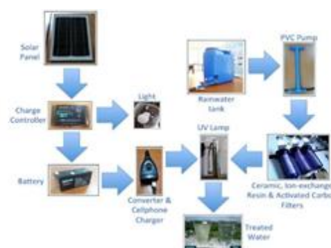
Figure 1: Operation diagram of Water-Electricity-Light System

context. This system is an offshoot from a water generation device fabricated for a graduate thesis in the Ateneo de Manila University (Philippines). It aims to address crucial water needs – for emergency use during disaster and for daily use in areas without safe drinking water sources. WELS can be connected to a water storage facility or a damaged municipal water source. Components are acquired off-the-shelf so replacement parts are accessible. The cost of the whole system is reasonably affordable ranging from US$600 to US$700 depending on components to be included. This system illustrates a concrete way to build disaster resilience in a community level. Training is conducted to learn operation and repair. WELS is easily replicable and technical support is readily available through QR code access. The operation diagram of the system is seen in Figure 1. In depth discussion on the technical aspect of the system can be found in Cabacungan, Tangonan and Cabacungan (2020, in press).