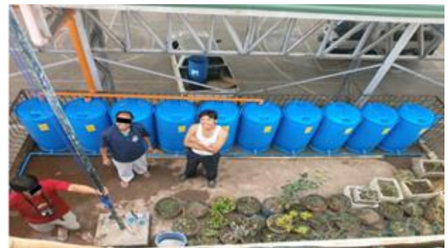
Figure 12: Rainwater harvesting using drums directly attached to roof downspouts

Continuous development and customization are applied on WELS based on the concerns raised and feedback given by the community. Co-innovation with the community happened. Construction of concrete rainwater storage facility is costly and may pose concerns. In Leyte, we saw a rainwater storage facility that has cracks and the walls are full of moss. We fabricated an improvised rainwater storage using drums for easy maintenance cleaning as shown in Figure 12.