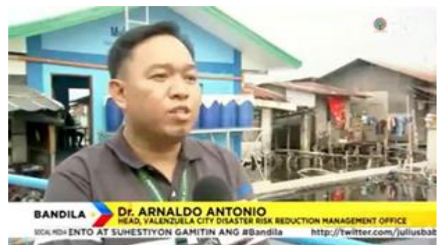
Figure 7: TV interview regarding WELS (shown behind interviewee) in Valenzuela

In Valenzuela (Metro Manila) buying and bringing water every day to their community was alleviated using their rain catchment. Figure 7 shows a TV interview with the rain catchment at the background. One resident quipped, “Kapag umuulan, mahirap lumabas, puwede na dito sa loob bumili ng inumin” (When it is raining, it is hard to go out, at least we can buy drinking water within the community). The locals started a thriving water selling business. Similar pre-positioning installations done in Valenzuela (NCR) were applied in GK communities in Angat, Bulacan (Luzon) and Capiz (Visayas), LGUs in Pila, Laguna and Magdalena, Sorsogon (Luzon), and in some barangays in Aparri and Benguet (Luzon). Some systems are not regularly used but are properly maintained to be used in times of emergencies while others are in operation for daily usage.