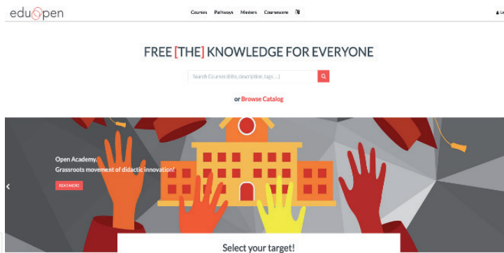
Figure 1. EduOpen platform.

However, it must be highlighted that, while indicated as a resource capable of increasing access to quality education [29], certain aspects of MOOCs have been criticised, especially the difficulties associated with assessment based predominantly on multiple-choice questionnaires [30, 31], poor interaction with participants [32, 33], failure to meet instructional design criteria [30, 34] and use of technology that is not accessible or user-friendly [30].