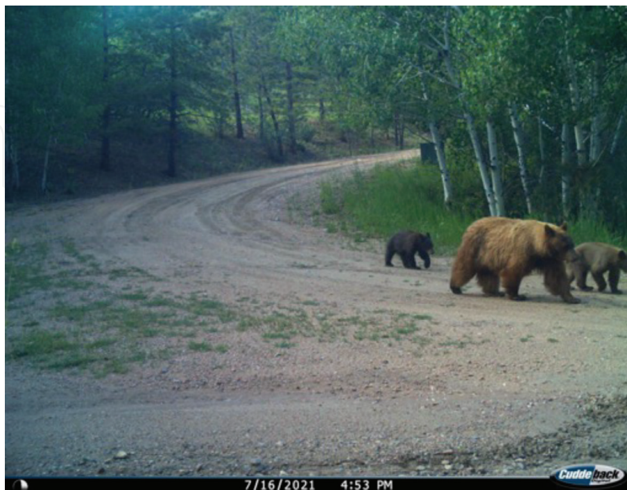
Figure 2. Trail cameras are widely available, allowing citizen scientists to capture the movement of animals, such as this family of American black bears ( Ursus americanus ) in Colorado, USA.

The field of big data analytics is advancing rapidly, utilizing machine learning (ML) algorithms to provide automated analysis of digital imagery [35]. Applications include identification of animals in pictures and systematic behavioral descriptions [71]. Today, deep convolutional neural networks (CNN) are applied to