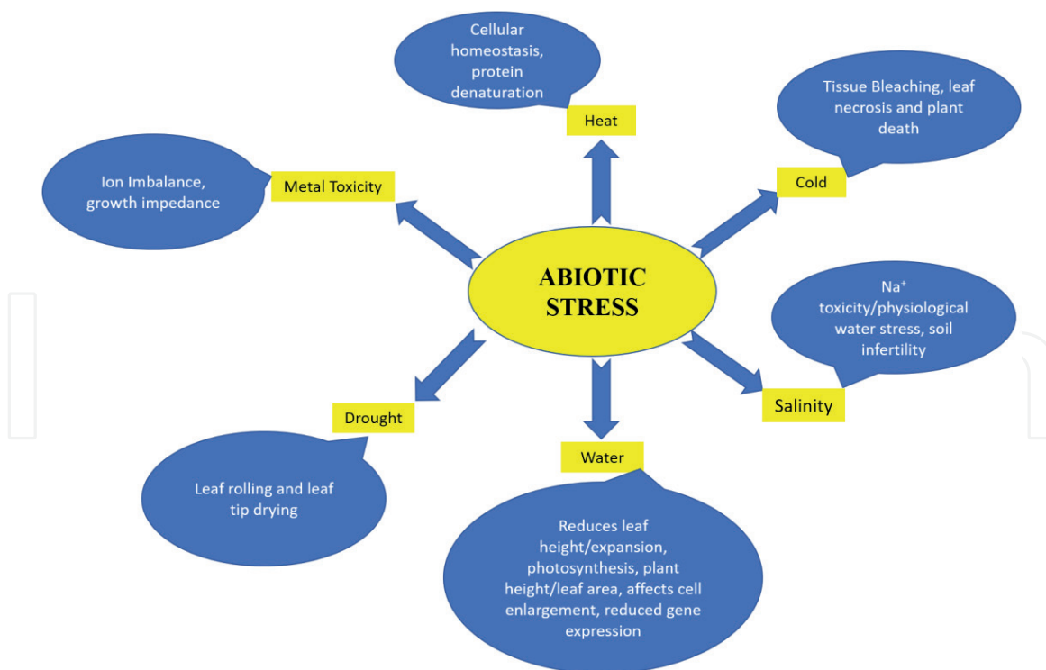
Figure 1. Types of abiotic stress with their effects on growth of plants.

distribution and cell homeostasis. Crop plants are adversely affected by abiotic stress conditions. On account of the current scenario, more than about 50% loss of yield/year is sole because of abiotic stresses such as drought, salinity, heat, and cold. In developing countries, drought and low soil fertility has been proved to be a major cause for affecting crop production [22]. Recently, several transcription factors (TFs) due to their efficacy as a master regulator, have been proving as a potential candidate for genetic engineering to breed stress-tolerant crops and improve stress tolerance [23]. Six Asian region countries namely Bangladesh, China, India, Indonesia, Pakistan, and Thailand are actively involved in the Research and Development related activities for the development of abiotic stress-tolerant crops [24]. Various abiotic factors along with their probable significance are depicted in Figure 1 .