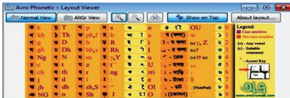
Figure 3. Avro keyboard layout.

Development of aviation Machine Translation systems: This application can find its use with travelers as well as people related with aviation industry. The