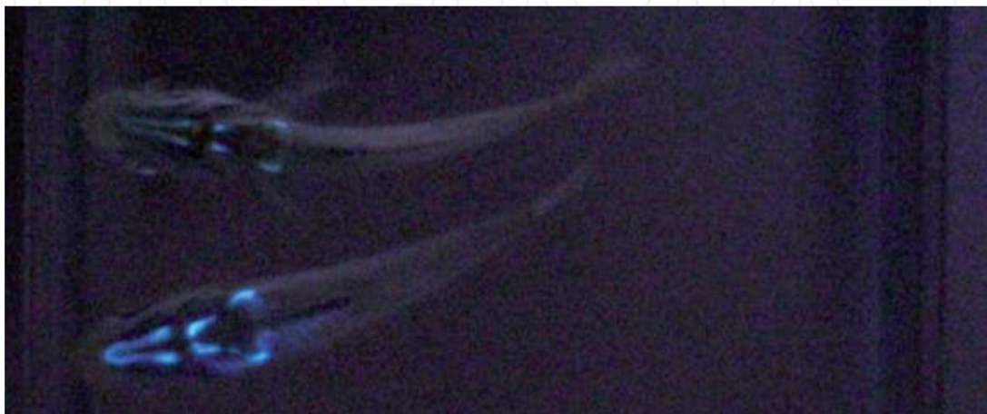
Figure 4. Ventral view of Parapriacanthus ransonneti taken in a dark room to capture the light emission from these body regions.

This example of a “kleptoprotein” form of luminescence where both the substrate and the enzyme are provided through the diet, provides an additional novel category of luminescent reactions, as of yet not considered. Moreover, this highlights the possibility that other luminescent species may utilise this capability to obtain active exogenous luciferase from their gut. Potentially, this may include several species of fishes that predate on ostracods, whose light organs are often connected to their digestive tracts. This research may suggest that semi-intrinsic and “kleptoprotein” luminescent behaviours may be more widespread than previously considered, with proteins associated with other biological processes potentially being able to be attained via diet as opposed to gene expression.