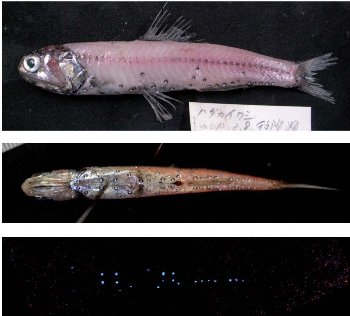
Figure 2. Photographs of Diaphus sp. captured from a lateral (upper) and ventral view (middle). Displaying the photophores that produce a blue luminescent light (lower).

Support for a dietary origin for luciferin in a number of stomiids is supported by their ability to uptake other small molecules to utilise in light emission. An example of this is shown in several species of loose-jaw dragonfish ( Malacosteus spp.), that have a rare ability to emit longer wavelengths of luminescence that is red in colour, as opposed to blue light which is more ubiquitous in the oceans [1]. Malacosteus can also detect red wavelengths of light using a distinct mechanism requiring derivatives of bacteriochlorophylls c and d that enhance its sensitivity to these longer wavelengths [66]. As vertebrates are unable to synthesise chlorophyll, Malacosteus could obtain this through a diet, predominantly of grazers such as copepods that will contain phytoplankton derived pigments in their guts [64]. This strongly supports the concept that other small organic compounds such as luciferins can be taken up by dragonfishes, as well as other Stomiiformes to utilise in their bioluminescent reactions.