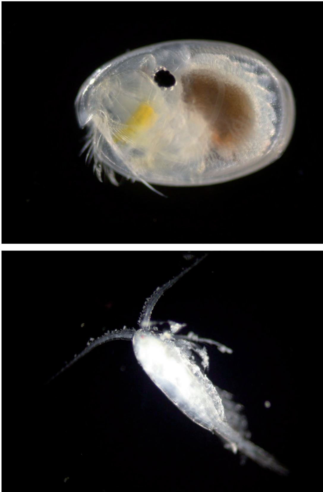
Figure 1. Photographs of luminescent organisms known to synthesise their luciferins. The ostracod Vargula hilgendorffii (upper) synthesises cypridinid luciferin and the copepod Metridia pacifica (lower) synthesises coelenterazine.

luminescent cloud of mucus is emitted from specialised glands from two types of cell, one producing the luciferin and the other the luciferase [25].