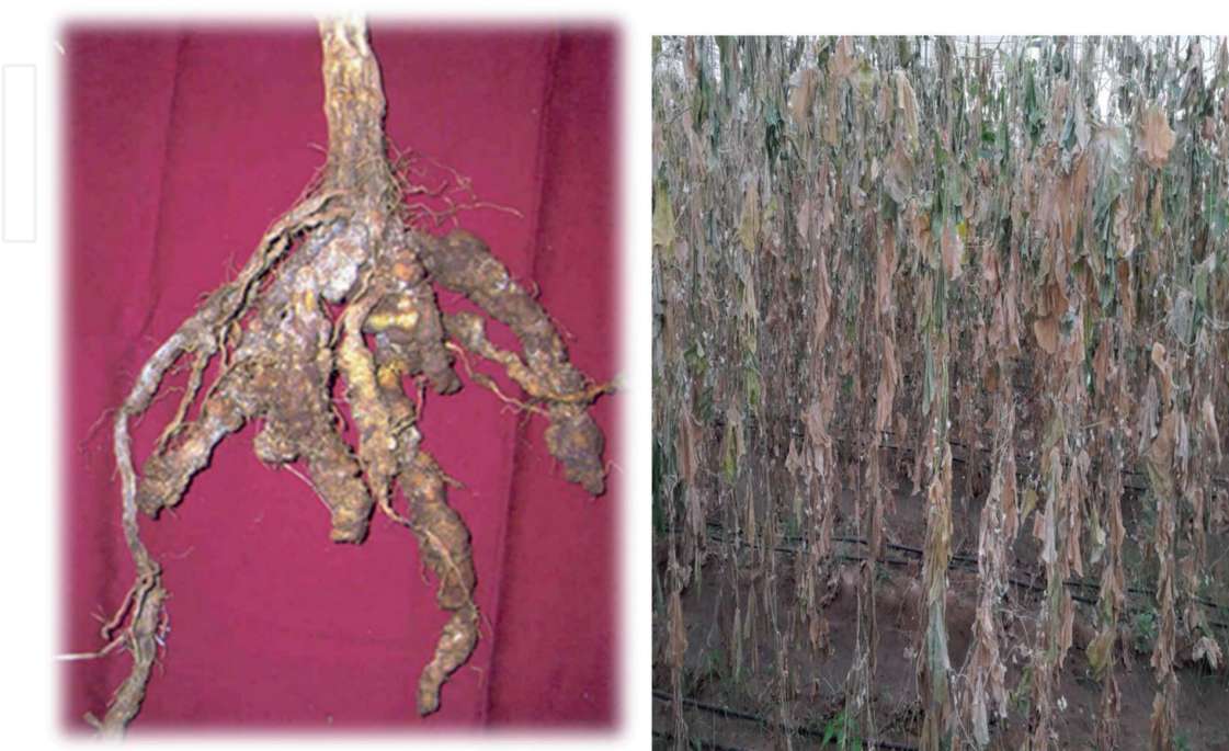
Figure 4. Root infested with Meloidogyne spp. and wilt fungus.