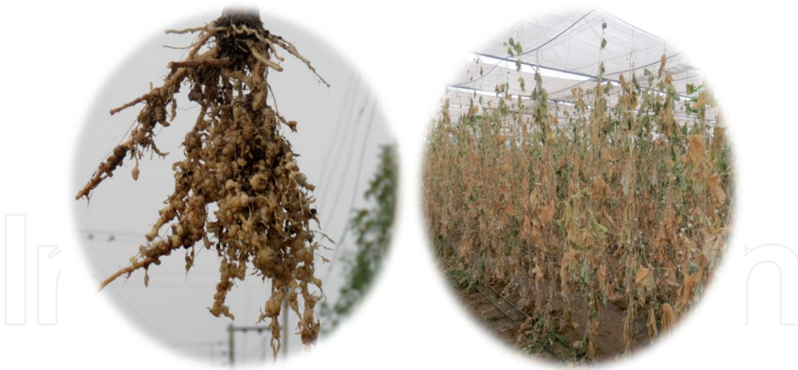
Figure 1. Nematode infestation under polyhouses a. root-knot nematode infested root B. crop failure.

protected structures and also reduced the quality of the produce of crops in the market due to unthrifty growth.