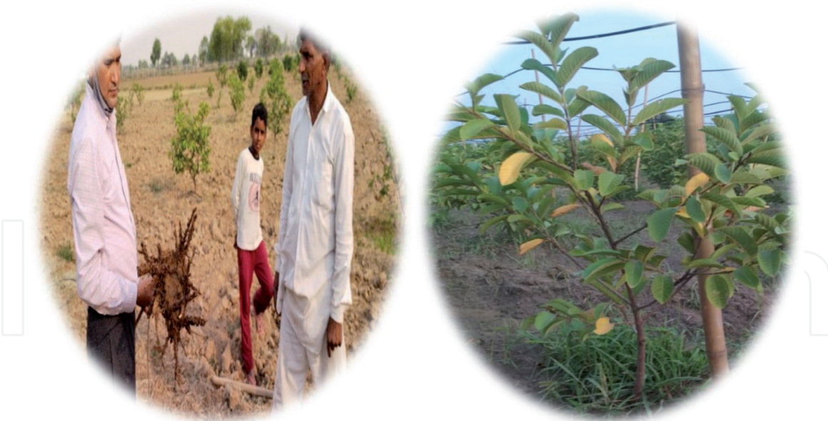
Figure 2. Guava orchard infested with root knot nematode.