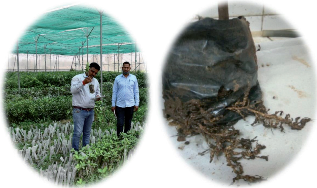
Figure 3. A. Nematode infestation in the nursery B. guava nursery infested with root knot nematode.

Nematodes associated with other secondary micro-organism increased the losses' manifolds. Phyto parasitic nematodes provide avenues for secondary pathogens viz., fungi, bacteria, viruses, etc. and favor the establishment on host. Nematode alter the host physiology for colonization of secondary microbes. However, nematode