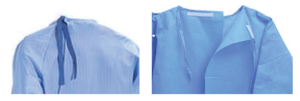
Figure 4. Different closure types.