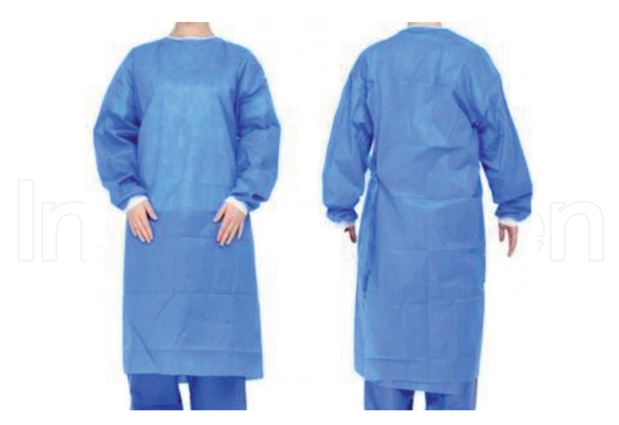
Figure 1. Front and back of a surgical gown.

The model characteristics (size-sleeve length, closure properties, etc.) and fabric properties of surgical gowns worn in surgical settings vary according to the characteristics specified in the technical specifications of the Ministry of Health. Figure 2 includes various surgical gowns.