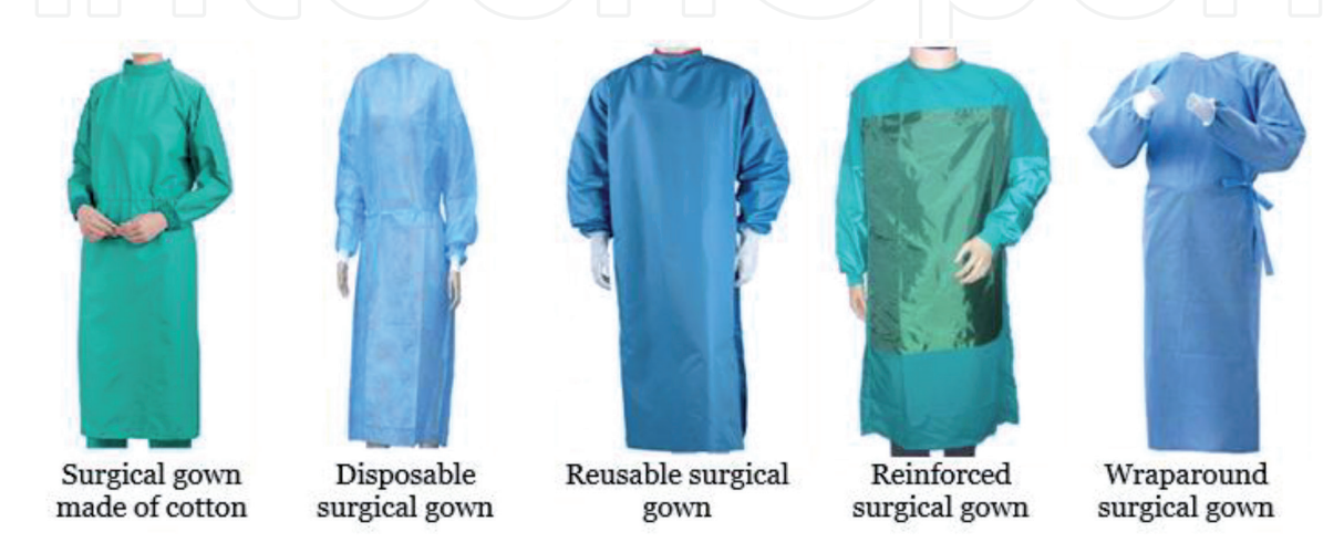
Figure 2. Various surgical gowns.

In general, there are two different kinds of sleeves in the gowns sold in the market at present: Raglan sleeves and set-in sleeves. A raglan sleeve, which can be identified by the diagonal seam line from the neckline to the armpit, is the most common type of sleeve used in surgical gowns [21]. Another type of sleeve construction found in many garments is commonly referred to as a set-in sleeve. The set-in sleeve is more difficult to construct and offers less freedom of movement