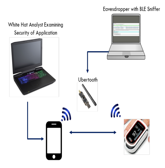
Figure 2. Security Analysis Methodology Diagram

the hop interval and increment, and the CRC init. If this information is sniffed, the Ubertooth automatically follows the connection of a specified MAC address. If the collected traffic is encrypted, the attacker would likely select a new victim. However, if the data is in plain text, it provides an easy target for the attacker to see if there are any passwords or important data values available. Even if the data is obfuscated in a manner that may not be obvious at first, a determined attacker can parse through the data to interpret it.