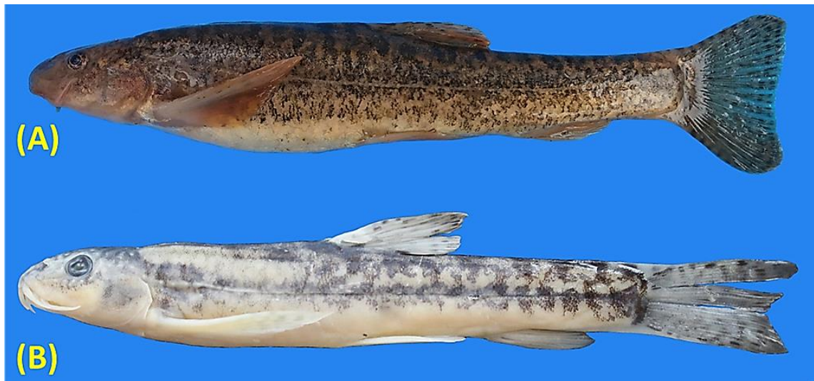
Fig.1. (A) Live specimens of Oxynoemacheilus veyseli n. sp., uncatalogued, Turkey: Kars prov.: Bozkuş River, Aras River drainage, and (B) Oxynoemacheilus araxensis NHVUIC 17006-1, 52.9mm SL, Turkey: Erzurum prov.: Karasu River at Kandilli, Euphrates-Tigris river system.