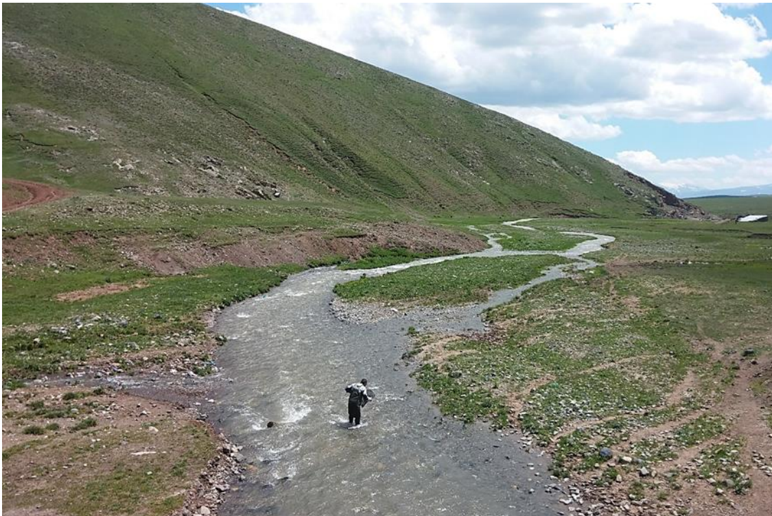
Fig.7. Type locality of Oxynoemacheilus veyseli n. sp., Turkey: Kars prov.: Bozkuş River, near Kars city, Caspian Sea basin.

lateral and three central pores in supratemporal canal. Anterior nostril opening at end of a low, pointed and flap-like tube. Mouth arched. Lower lip thick with a deep median interruption and some marked furrows in lower lip, upper lip with a small inception (not marked in some individuals). Caudal fin with 8+9 or 9+9 rays. Longest known specimen 116.8mm SL.