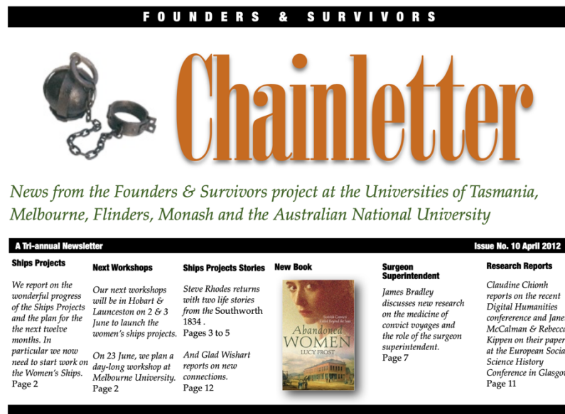
Figure 7 No 10., April 2012 of 'Chainletter'