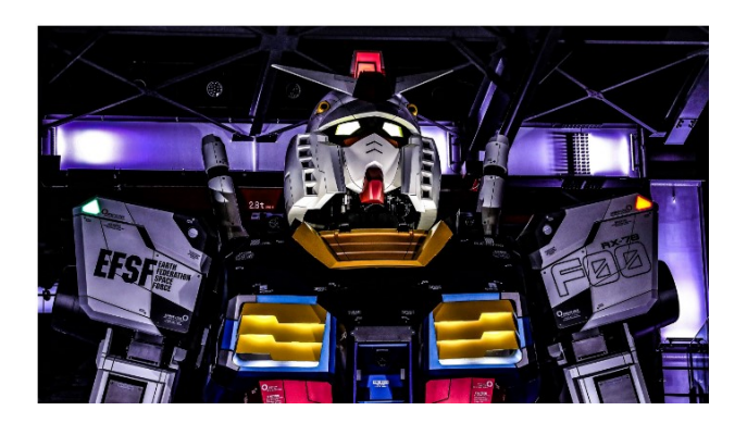
Figure 2. Bipedal Robots: Gundam Dock