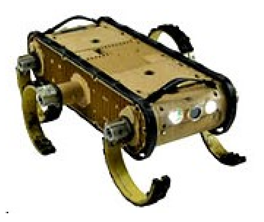
Figure 6. Six-legged Robots: RHex

7. Great example would be RHex, bio-inspired hex robot built for traversing terrain. He can ride on stones, mud, sand, snow and railway tracks, and even climb stairs and descents up to 45 degrees (Figure 6) [24] [25].