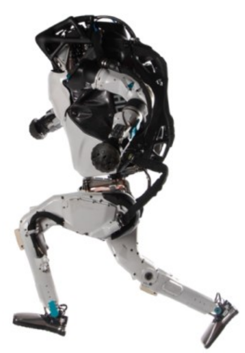
Figure 1. Bipedal Robots: Boston Dynamics