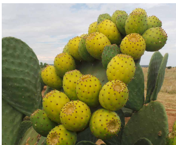
Cactus pear fruit in Bloemfontein, South Africa.

Although there is much interest in the cultivation of cactus pear, a newly planted cactus cladode requires two years to fully establish and start producing enough to enable the plant to enter the production cycle. Some farmers have found it a challenge to commit to this amount of time. Furthermore, the plant needs to be protected against livestock or wildlife grazing as well as other possible attacks such as birds and rabbits and even cochineal for which there is a lack of explicit treatment methodology. Once in production, fruit collection and cladode harvesting require manual labour, which can be costly. And finally, Material Transfer Agreements regulations severely affect the expansion of cactus planting materials exchange between countries, added to a lack of resources and suitable economic policies in terms of technical and financial support hinder its adoption.